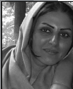
GOLROKH EBRAHIMI IRAEI WRITER IRAN