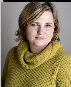
ELENA MILASHINA JOURNALIST RUSSIA