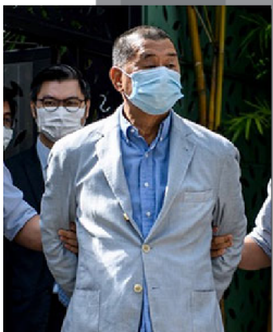
JIMMY LAI PUBLISHER HONG KONG