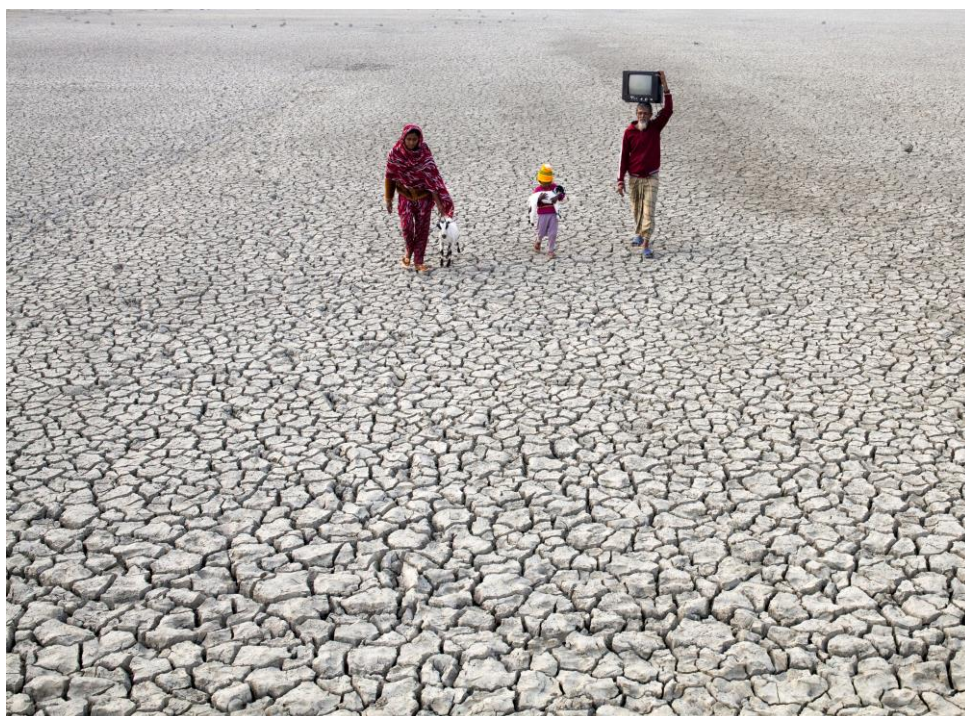
Local villagers seen on a dried river bed in 2015 in Satkhira, Bangladesh.

At the current level of 1.1°C of global warming above pre-industrial levels, we are already witnessing devastating impacts, such as heatwaves and unprecedented wildfires, back-to-back tropical storms of high intensity and severe drought. These events, together with the slow-onset impacts of climate change such as sea-level rise, severely affect the enjoyment of the human rights of millions of people, including the rights to life, water, food, housing, health, sanitation, adequate standard of living, work, development, healthy environment, culture, self-determination as well as the right to be free from discrimination and cruel, inhuman and degrading treatment, among others. This publication describes how people are denied enjoyment of these rights due to climate change, and what the future threats are. For example, about 6,300 people died in the aftermath of super-typhoon Haiyan in the Philippines in 2013 and almost 4 million were affected by the 2019 cyclones in Mozambique, Malawi and Zimbabwe, being killed, displaced and losing access to schools, hospitals and sanitation. According to the Internal Displacement Monitoring Centre, on average, 20.88 million people were internally displaced every year by weather-related events between 2008 and 2018.