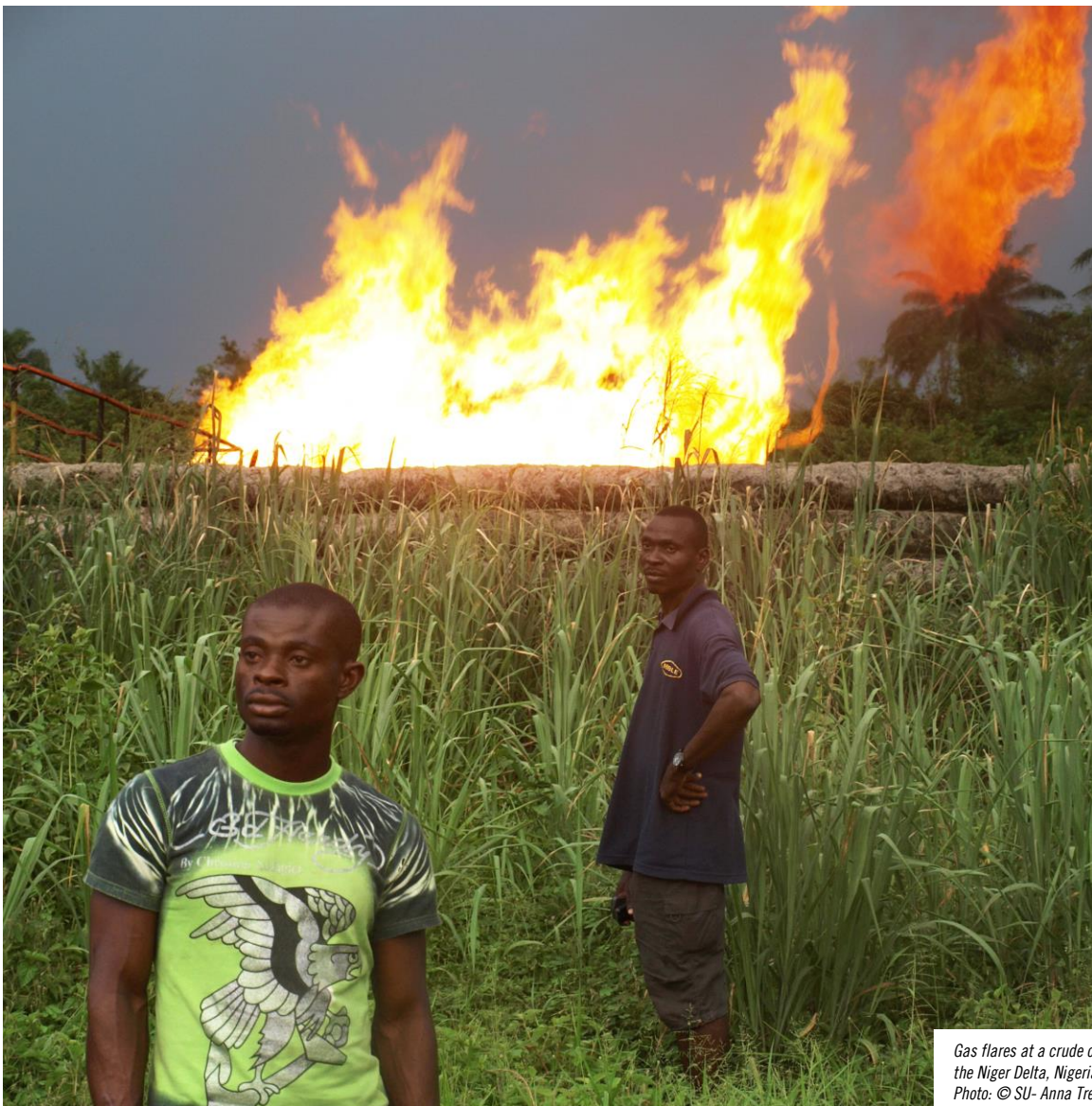
Gas flares at a crude oil extraction site in the Niger Delta, Nigeria, April 2010.

However, wealthier countries continue to fail in this duty. Although the amount of international climate finance to support climate change mitigation and adaptation in developing countries is increasing, this is far from what is needed to ensure that the rise of global average temperatures is kept below 1.5°C above pre-industrial levels and that mitigation and adaptation efforts do not translate into an excessive burden for people in developing countries. In particular, the target for developed countries to jointly mobilize USD$100 billion a year by 2020 to support developing countries for climate change mitigation and adaptation measures remains significantly unmet, while the vast majority of the funds provided have been in the form of loans as opposed to grants, half of which were non-concessional, meaning that the loans were offered on ungenerous terms. Moreover, states have until now failed to agree on adequate mechanisms to mobilize new and additional finances for loss and damage caused by the effects of climate change.