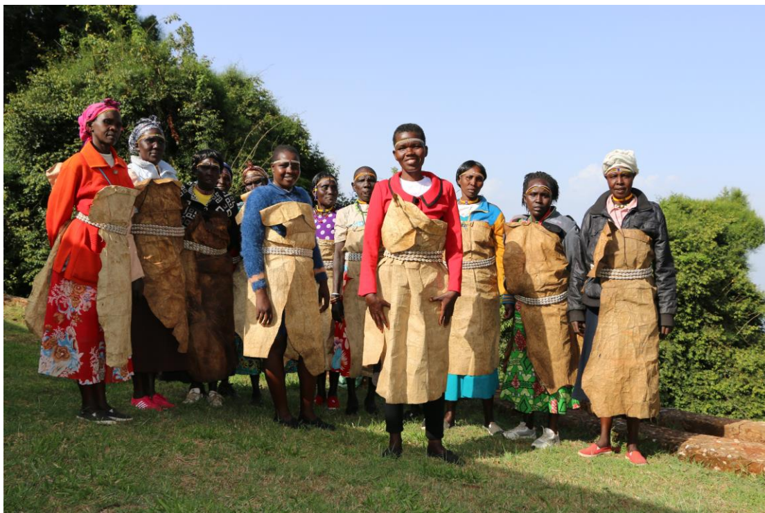
Members of the Sengwer Indigenous People, Kenya - The Sengwer have suffered repeated forced evictions from their forest lands in Embobut, Kenya, due to abusive forest conservation policies. They are defending their human rights, and their demands are clear: the government must recognize their land rights and work with them to protect the forest.

States must therefore ensure that measures intended to protect people from the effects of climate change do not result in the violation of other human rights and must avoid using the response to climate change to justify violations of human rights. They should also ensure a just transition for all workers and communities affected by climate change and the decarbonization process, taking the opportunity to reducing poverty and correct existing inequality in the enjoyment of human rights.