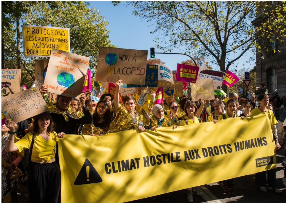
Amnesty International France's supporters take part in the World Climate March, Paris, 20 September 2019

Given the extensive knowledge about the causes and harms of climate change, failure to take adequate action to reduce climate change, to support people to adapt to its unavoidable effects and to provide remedy to those whose rights have been violated as a result of the loss and damage resulting from climate-related impacts, represents a human rights violation. Human rights violations related to insufficient ambition on climate action are no different than other human rights violations, and even bigger in scope. They condemn millions of people to premature death, hunger, diseases, displacement, not just in the future but also at present. They contribute to conflicts and to the unfolding cycle of human rights violations. They perpetuate and accelerate current inequalities and discrimination against those who are already being oppressed by systemic injustices. Failure to adequately tackle the climate crisis is a form of discrimination.