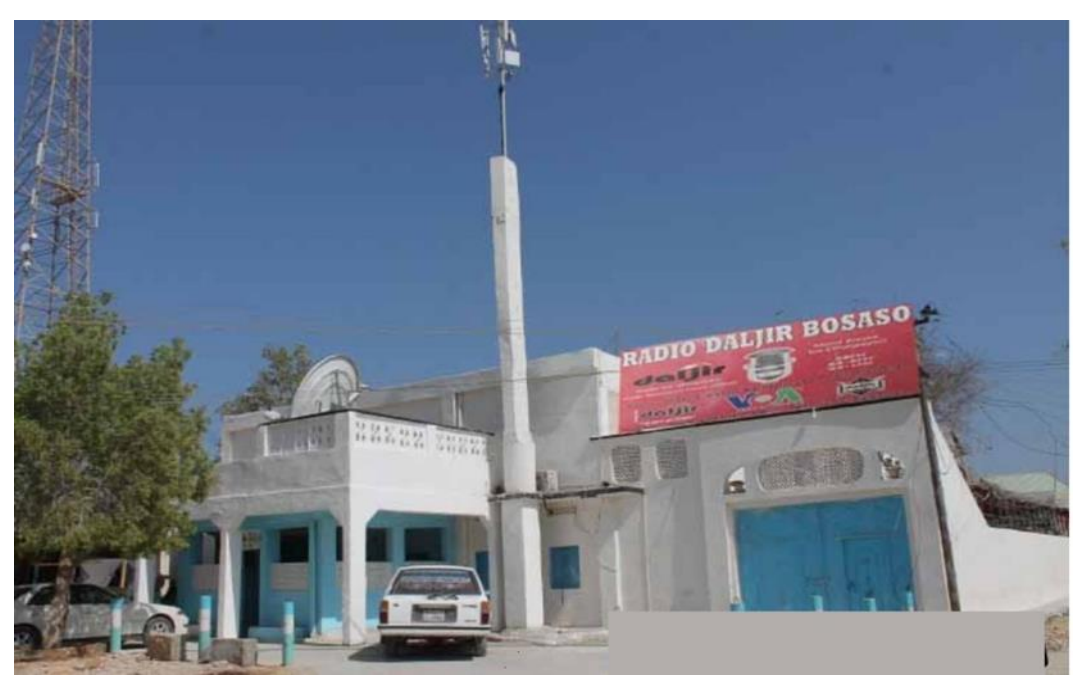
Radio Daljir offices in Bosaso.

According to media advocates and one individual who has knowledge of the activities that led to the raids, the raids came a few days after Radio Daljir aired interviews and reports relating to a detainee who allegedly died as a result of police mistreatment in Bosaso. 166 The police did not produce a court order allowing for the search and the temporary closure of the radio station. 167