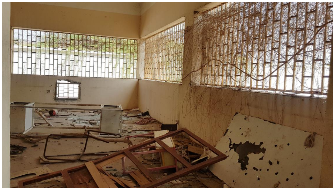
A vocational centre in Aden for persons with hearing impairment visited by Amnesty International, 17 June 2019, remains in ruins several years after it was bombed in 2015.

In at least one case documented by Amnesty International, these economic difficulties have resulted in the family of a person with disability resorting to extreme measures. A family member of a man in his 20s with a physical disability and speech difficulties told Amnesty International that, over the past year, they have had to rely on money he gathers from begging along the highway – something he did not use to do in the past. The family’s main breadwinner, an older brother, has been out of a job since they were displaced by fighting in Ta’iz in May 2018. 163