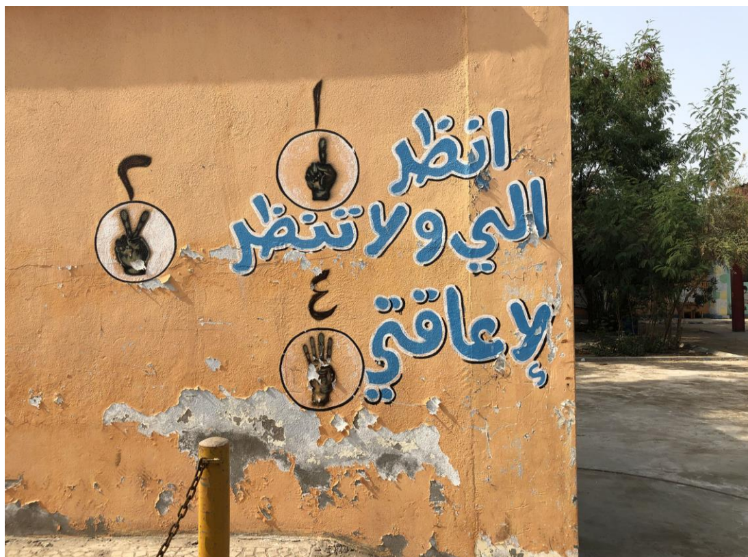
A mural outside a school for children with disabilities in Aden reads "See me, not my disability", 17 June 2019.

The mother of a 14-year-old boy who has cerebral palsy said her son used to go to a special education facility in Aden where he was taught for free. When the fighting began, the centre closed temporarily, but he did not return even after it reopened. "Everything is difficult. I didn't find anyone to take him back to school... The commute is difficult... It requires additional money... I just teach him Qur'an at home now." 143 The mother wept as she explained the family's inability to afford transport costs with the prices of everything going up.