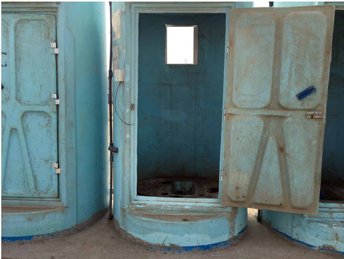
During a visit to Sabr Camp in Lahj, 12 June 2019, Amnesty International observed how latrines were inaccessible for persons with disabilities. These conditions, also observed in other camps visited by the organization, have an impact on persons with disabilities' capacity to practise self-care and undermine their autonomy, privacy and inherent dignity.

She got so sick, it was like she was dying. I ran to the hospital. I didn’t even have my headscarf on – the doctor gave me his thing [his jacket] to cover up... Her face and lips had turned black... The doctor said it was because of the poor ventilation in the tent. My daughter needs good ventilation and oxygen... The doctor said the tent is no good for her and that she needs to get out of here. 67