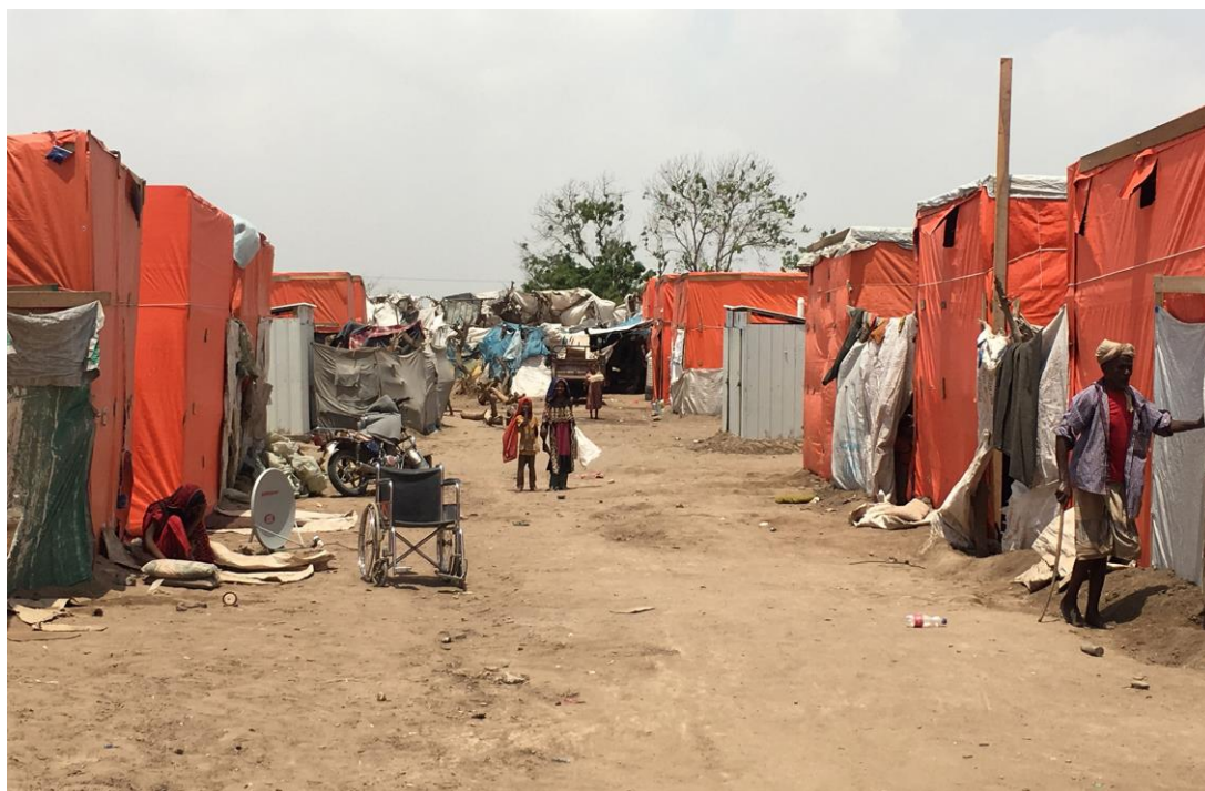
Persons with disabilities spoke of difficulties obtaining equal access to services and facilities in camps for displaced persons. The few who did have wheelchairs said they were not suitable for the rugged terrain in the camps, were generally of low quality and did not facilitate their autonomy and independence. Mishqafa Camp, Lahj, 11 June 2019.

The needs among displaced persons are immense in a country that is described by the UN as the world's worst humanitarian crisis. 35 Since mid-2018, there has been a spike in displacement and a mushrooming of official and unofficial IDP sites, including on private lands in southern governorates under the control of the Yemeni government. 36 Added to this, humanitarians often report having to shut down crucial programmes due to donors failing to honour their pledges. 37 Amnesty International understands these challenges, but the Yemeni authorities, donors and those in charge of running and implementing the humanitarian response still have a responsibility to ensure that the rights of persons with disabilities, including equal access to services and information and protection in situations of risk, are respected, protected and fulfilled and that key principles, including non-discrimination and inclusion, are upheld. 38