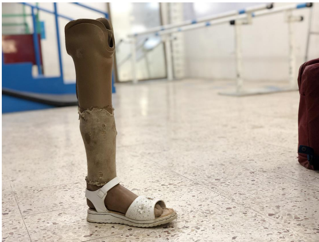
A prosthetic limb belonging to an 11-year-old girl injured when a mortar landed on her home in 2015 awaits repair at the Aden Prosthetics Centre, 18 June 2019. A doctor working at the facility said the centre is currently not equipped to produce lightweight prostheses or activity-specific ones for children under the age of 10.

The Ministry for Social Affairs and Labour, in conjunction with the Ministry of Health, is responsible for providing assistive devices and technologies, 117 a state obligation and responsibility that cannot be handed over to non-governmental organizations. 118 States have an obligation to take immediate steps, making full use of their available resources, including those made available through international co-operation and assistance, to ensure that persons with disabilities have access to health care, including health-related habilitation and rehabilitation services and programmes, including the provision of assistive devices and technologies. 119 According to the Special Rapporteur on the rights of persons with disabilities, access to essential health services, habilitation, rehabilitation and assistive devices needed by persons with disabilities owing to their impairment should be considered as core obligations that are not subject to progressive realization. 120