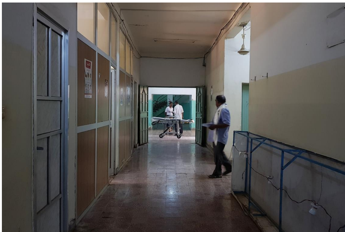
During a visit to the Aden Central Psychiatric Hospital, 19 June 2019, Amnesty International found large parts of the facility in disrepair and witnessed unhygienic conditions, including the pungent smell of urine in wards. The Office of the High Commissioner for Human Rights has deplored the practice of forced institutionalization of persons with disabilities and has called for its prohibition.

A 21-year-old woman living in one of Aden's neighbourhoods who has limited mobility has been traumatized repeatedly by the war; she was hit by stray bullets on two different occasions three years apart. Within the first year of the current conflict, she lost three family members: she lost her father when he was shot by a Huthi sniper positioned on the roof of Jamhourri Hospital in Aden; her husband died from dengue fever after they had been married only for a few months; and her brother was killed when a mortar landed on their family home. She also witnessed her friend being raped. She subsequently became addicted to painkillers and was admitted to a psychiatric hospital in Sana'a. She said: "I can't remember anything because I was injecting myself, anywhere I could – in my thigh, leg – like heroin. I used to get them to alleviate the pain... I can't bear much anymore. Whenever something happens, I get short of breath. I get very angry." 130