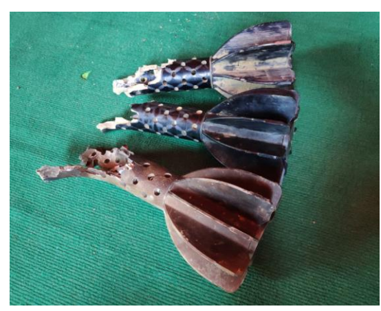
120mm and 60mm mortar tailbooms found in Ywar Haung Taw village, Mrauk-U Township, photographed 20 March 2019

A statement posted on the website of Senior General Min Aung Hlaing, Commander-in-Chief of the Myanmar military, claimed that "AA terrorists attacked a military convoy while the convoy was marching into Mrauk U town for security" and that "AA terrorists took cover in civilian houses." The AA denied being engaged in any fighting in Mrauk-U town that evening; although admitted to attacking a Myanmar military convoy around 30km away earlier that day. 58