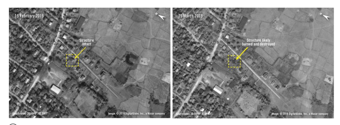
Imagery above shows the probable burning and destruction of a structure in Ywar Haung Taw village. The panchromatic imagery inhibits the ability to determine if the structure was razed by fire but it does appear to have been destroyed.

Amnesty International obtained photographs, taken on 20 March, of mortars villagers claimed to have found in Ywar Haung Taw following the attack. A military expert at Amnesty International confirmed they were the tailbooms of 120mm and 60mm mortars, noting the matching colour and stencilling; all were likely made in Myanmar. The distinctive shape and number of fins is similar to those of mortars photographed by Amnesty International in northern Myanmar in 2017.56