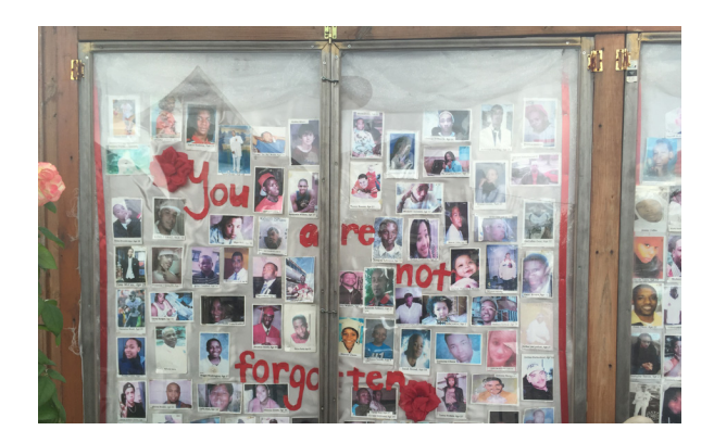
Memorial to more than 100 children and young adults of the St Sabina Community in Chicago who have been killed by gun violence

Children in the USA are not immune from criminal firearm violence. Whether children are caught in