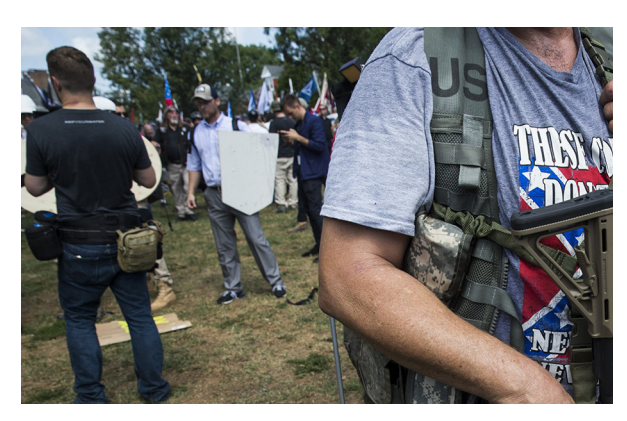
A protester open carries a rifle during clashes with counterprotesters at Emancipation Park, during the 'Unite the Right' Rally in Charlottesville, Virginia.<sup>874</sup>

Forty-five states currently allow open carry of firearms in public in some form. Some states impose restrictions on who may openly carry firearms, what type of gun may be subject to open carry, permitting requirements and/or restricted zones where open carry is not permitted.<sup>875</sup> The premise for allowing open carry of loaded firearms is that they are purportedly needed for self-defense and defense of others in dangerous situations. However, having and displaying a firearm may in fact escalate a disagreement, threat or altercation, leading to a deadlier encounter.