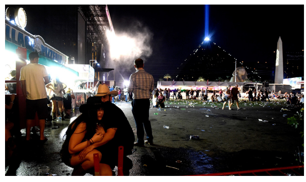
People take cover at the Route 91 Harvest country music festival after apparent gun fire was heard on October 1, 2017 in Las Vegas, Nevada. There are reports of an active shooter around the Mandalay Bay Resort and Casino.<sup>1000</sup>