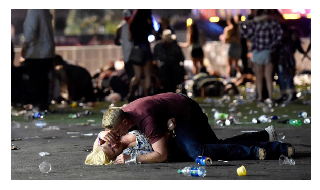
A man lays on top of a woman as others flee the Route 91 Harvest country music festival grounds after a active shooter was reported on October 1, 2017 in Las Vegas, Nevada. A gunman has opened fire on a music festival in Las Vegas, leaving at least 2 people dead. Police have confirmed that one suspect has been shot. The investigation is ongoing. The photographer witnessed