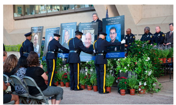
The Honor Guard places five large portraits of the officers killed in last week's sniper shooting targeting police during a 'Dallas Strong' candlelight vigil outside City Hall in Dallas, Texas, on July 11, 2016<sup>864</sup>