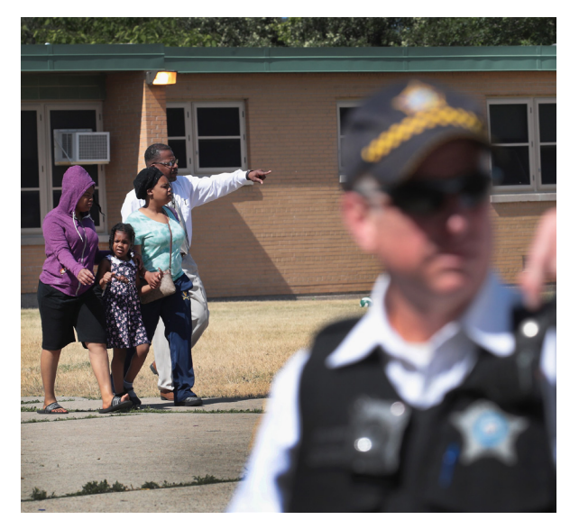
Joseph Warren Elementary School 429