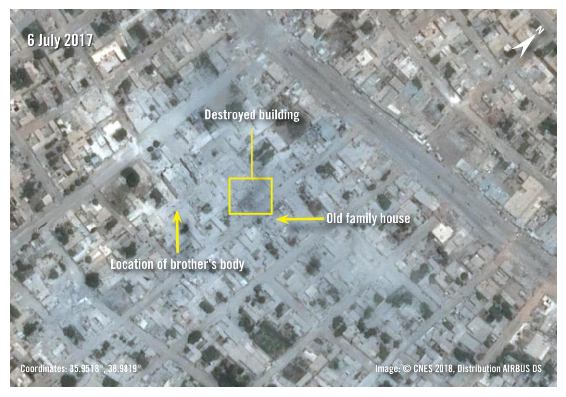
Satellite images showing the Aswad family's building before and after it was destroyed in a Coalition air strike which killed eight civilians, five of them children, on 28 June 2017.