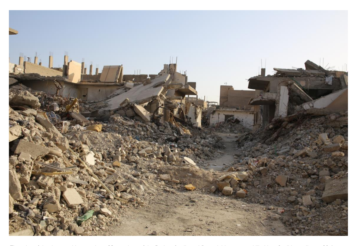
The ruins of the destroyed house where 28 members of the Badran family and five neighbours were killed in a Coalition strike on 20 August 2017 in Raqqa.

We went to Sharia al-Mansour and we took shelter in a two-storey house but after four days there Daesh forced us to move towards al-Fardous and Harat al-Badu neighbourhoods. So we went to Nazlet al-Shehade. On 18 July we fled from there because the fighting was getting closer. As we were fleeing nine of our relatives were killed in two bombardments – five of them in one of the houses just as they were about to leave and four others in the car. We had just left along with the rest of the women and children while the men were still at the house preparing to leave when the house and the car were bombed.