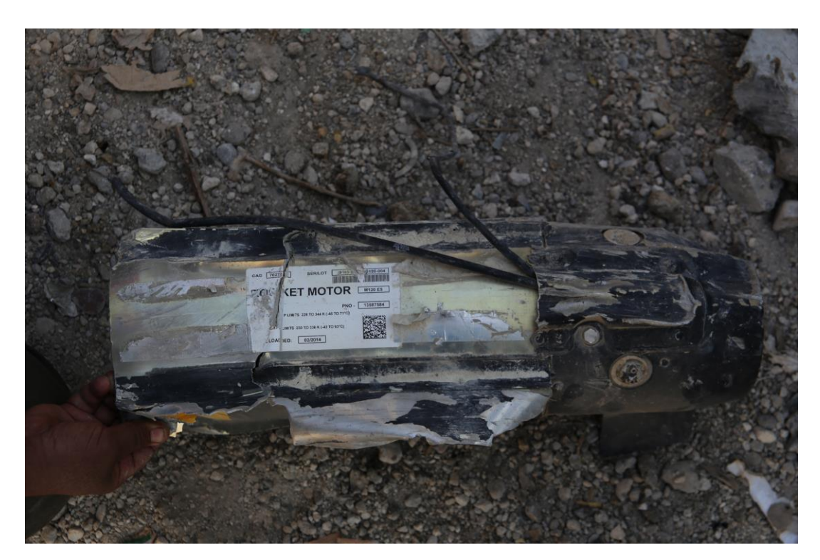
Fragment of the motor of a US-made AGM-114 Hellfire missile recovered among the ruins of the Aswad family building, destroyed in a Coalition strike which killed eight civilians on 28 June 2017.