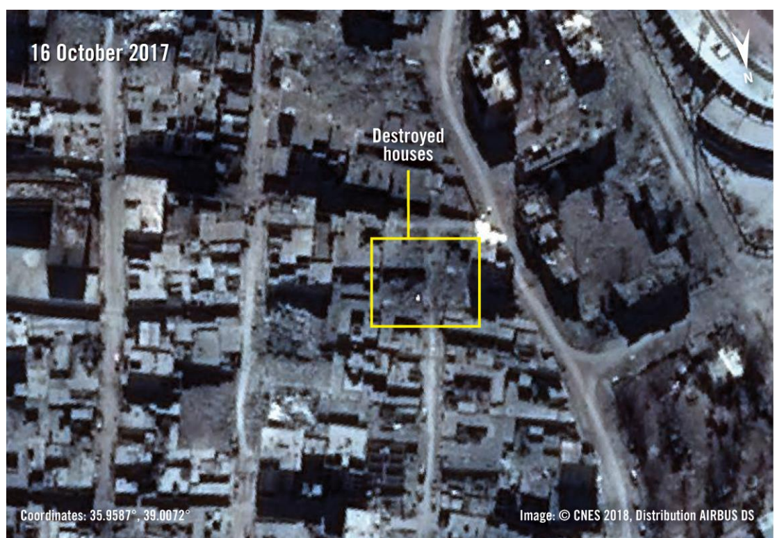
Satellite images showing the houses where 16 members of the Fayad family and neighbours were killed in Coalition strikes on 12 October 2017, before and after the strike.