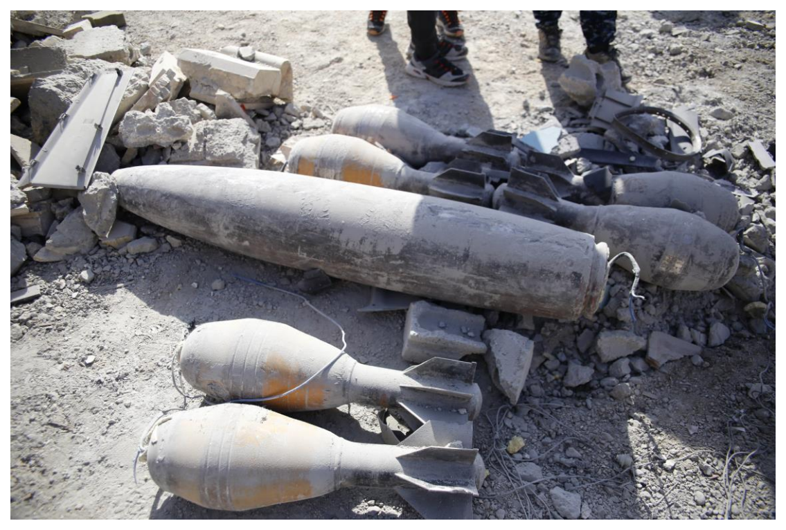
\label{locality} \textit{Unexploded MK 82 bomb dropped by the Coalition, which was subsequently rigged by IS and turned into a large IED, surrounded by six mortars locally produced by IS.