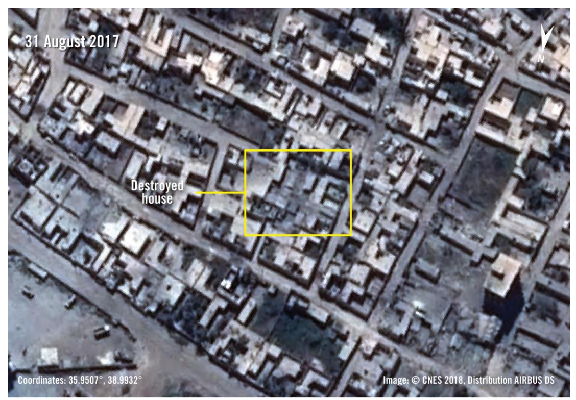
Satellite images showing the house where nine members of the Hashish family were killed in a Coalition strike, before and after the strike.