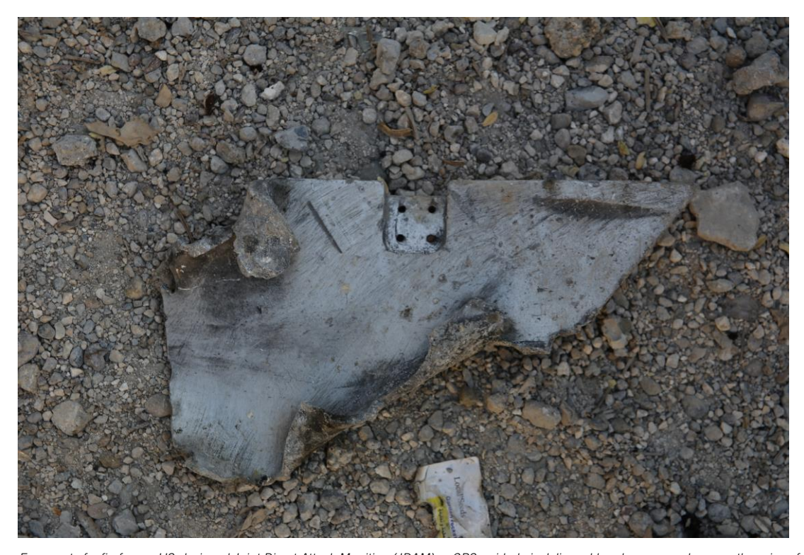
Fragment of a fin from a US-designed Joint Direct Attack Munition (JDAM), a GPS-guided air-delivered bomb, recovered among the ruins of the Aswad family building, destroyed in a Coalition strike which killed eight civilians on 28 June 2017.