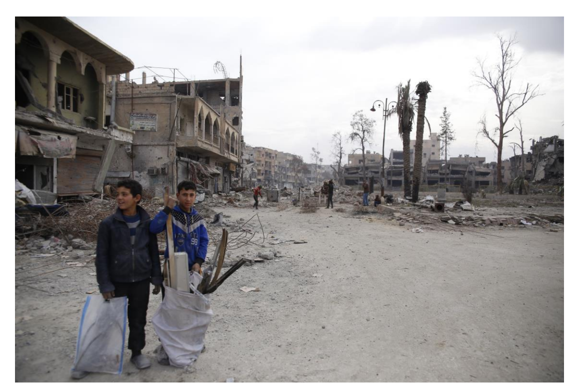
Children scavenging for scrap metal in the rubble of destroyed buildings in Raqqa, where many of the buildings were mined by IS and where children and adults are frequently killed and injured by mines.

Daily labourers and scavengers are sometimes referred to as "unofficial de-miners" because they risk their lives working in the rubble of bombed-out buildings which may be mined. A local businessman told Amnesty International: