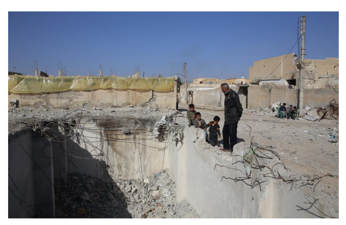
Mohammed Aswad looking down into the basement of his family's building, where his brother and seven other civilians, were killed in a Coalition strike on 28 June 2017. The building was completely destroyed.