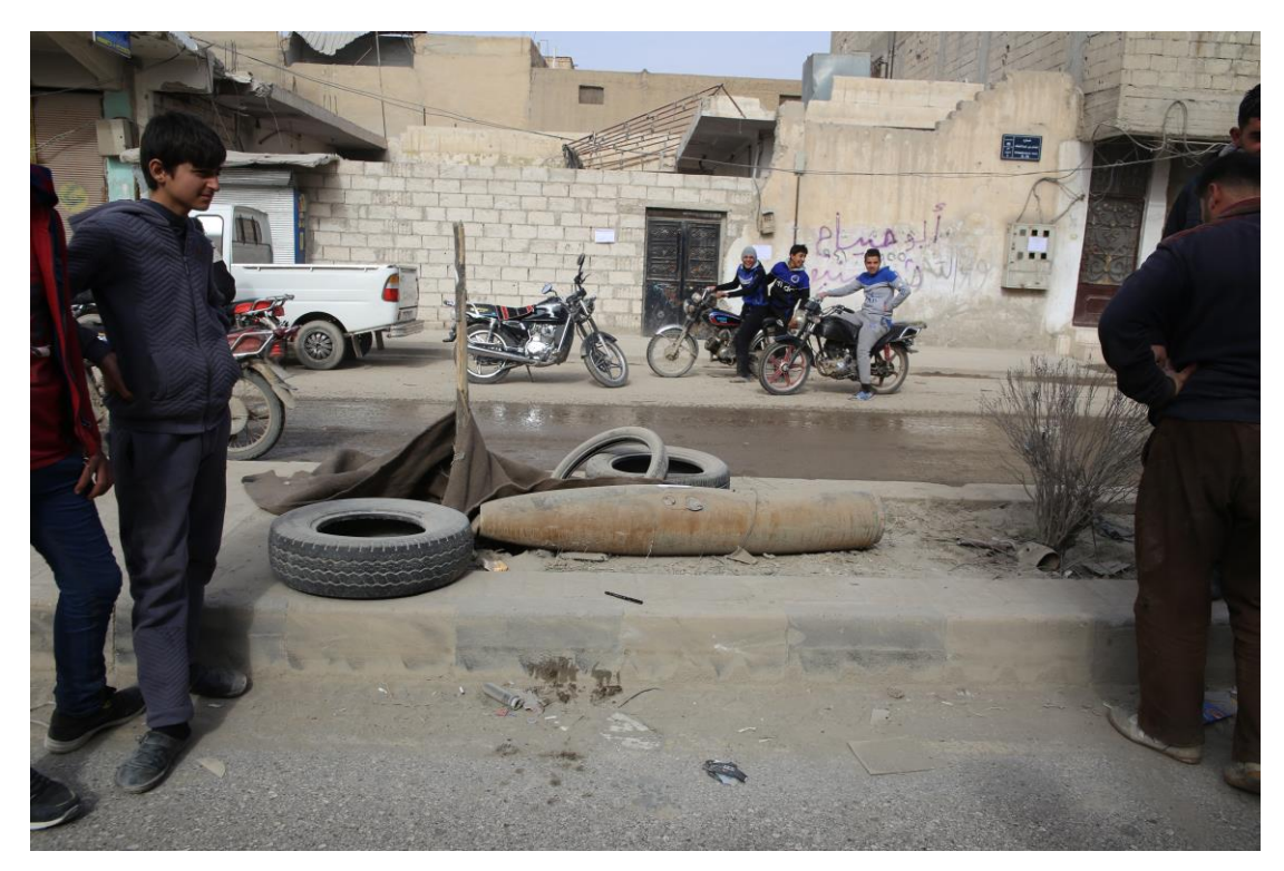
Unexploded MK 82 bomb, dropped by the Coalition, in a street in the centre of Raqqa. Months after the recapture of Raqqa unexploded munitions still littered Raqqa, in places where they posed a threat to civilians and where they could have easily been removed.