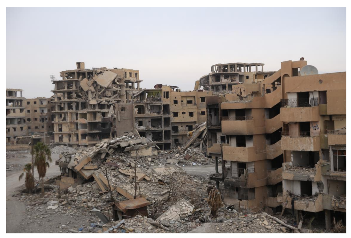
Entire neighbourhoods in Raqqa are damaged beyond repair.

In all the cases detailed in this report, Coalition forces launched air strikes on buildings full of civilians using wide-area effect munitions, which could be expected to destroy the buildings. In all four cases, the civilians killed and injured in the attacks, including many women and children, had been staying in the buildings for long periods prior to the strikes. Had Coalition forces conducted rigorous surveillance prior to the strikes, they would have been aware of their presence. Amnesty International found no information indicating that IS fighters were present in the buildings when they were hit and survivors and witnesses to these strikes were not aware of IS fighters in the vicinity of the houses at the time of the strikes. Even had IS fighters been present, it would not have justified the targeting of these civilian dwellings with munitions expected to cause such extensive destruction.