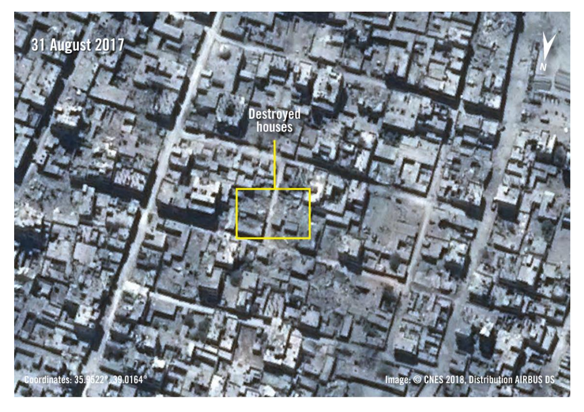
Satellite images showing the house where 28 members of the Badran family and five neighbours were killed in a Coalition strike on 20 August 2017, before and after the strike.