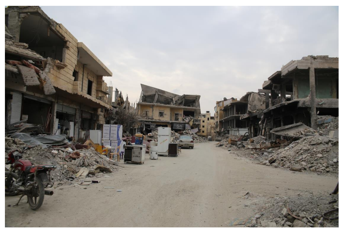
A shop selling household goods in the midst of destroyed buildings in Raqqa. Many business people, complain that their shops and warehouses were looted after they left the city.

they said there were mines planted by Daesh. But now, after everything has been looted, residents are allowed to come back even though there are still mines everywhere and people get blown up every other day by these mines.<sup>140</sup>