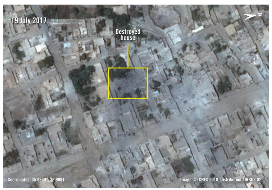
Satellite images showing the house where seven members of the Badran family were killed in a Coalition strike on 18 July 2017, before and after the strike.