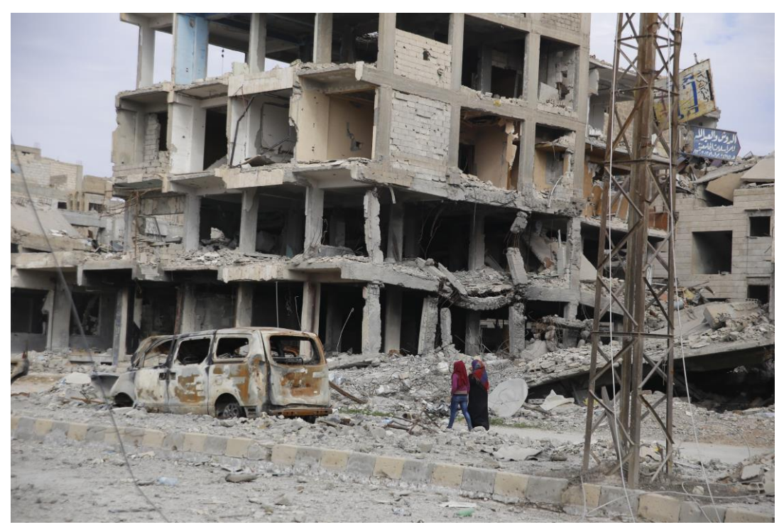
Women walking in rubble-strewn street past destroyed buildings in Raqqa.

Amnesty International's August 2017 report also detailed IS abuses against civilians during the battle for Raqqa, particularly IS's use of civilians as human shields as the conflict got underway and the group redoubled efforts to prevent residents from leaving the city. IS laid mines/IEDs to slow advancing SDF forces and to render exit routes impassable, set up checkpoints around the city to prevent residents from leaving, and its snipers shot and deliberately killed civilians who tried to escape. As the SDF captured neighbourhoods and front lines shifted within the city, IS forced residents to move deeper into areas which remained under its control.