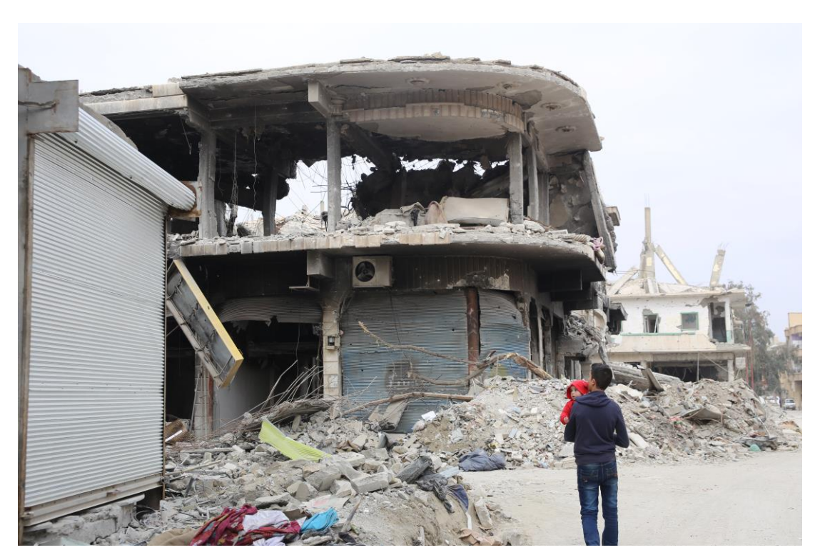
A young man holding a child staring at the ruins of bombed buildings in Raqqa. ② Amnesty International

Seven were killed and the rest were injured. Most of the dead and injured were women and children. The survivors had no option but to return home. A few days later a Coalition air strike destroyed their home, killing nine members of the family, mostly women and children.