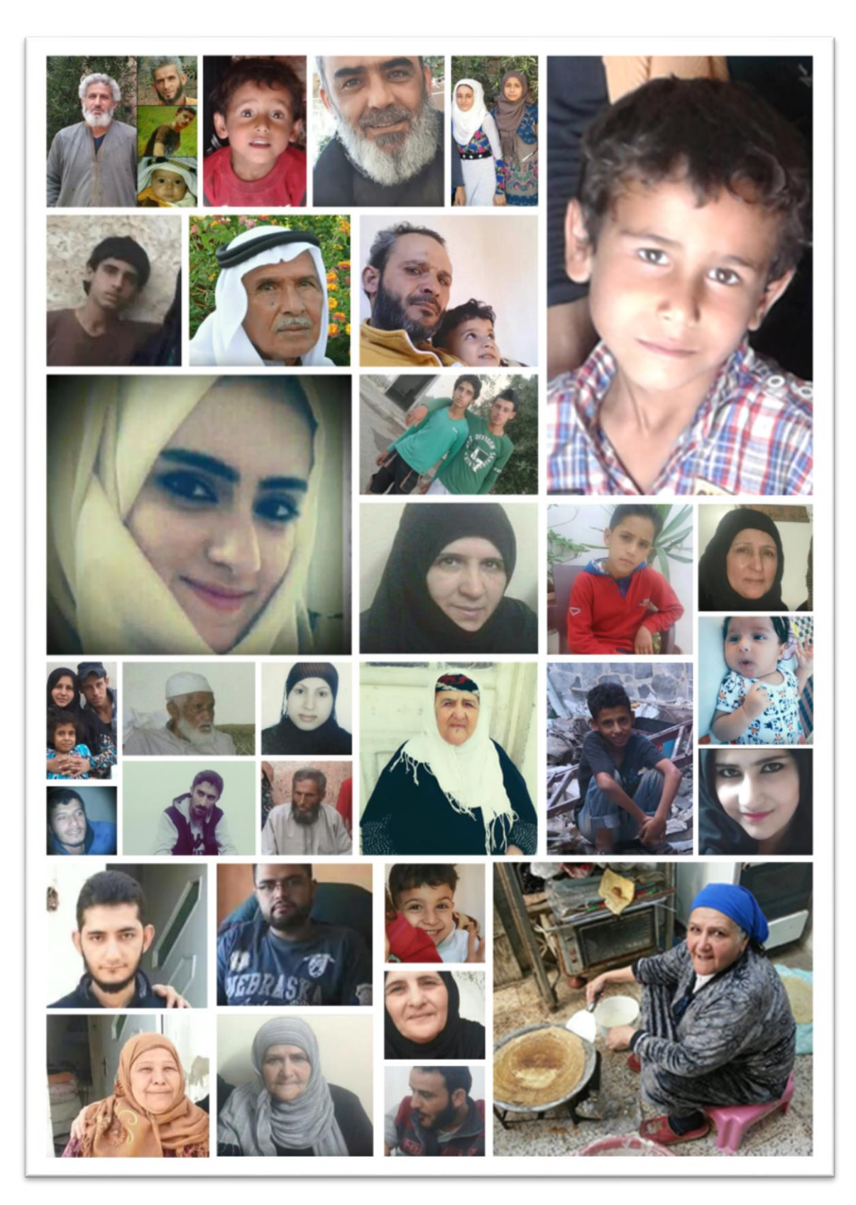
\textit{Members of the Badran family killed in three separate Coalition air strike on 18 July and 20 August 2017 in Raqqa. \\ @ \textit{Private} \\