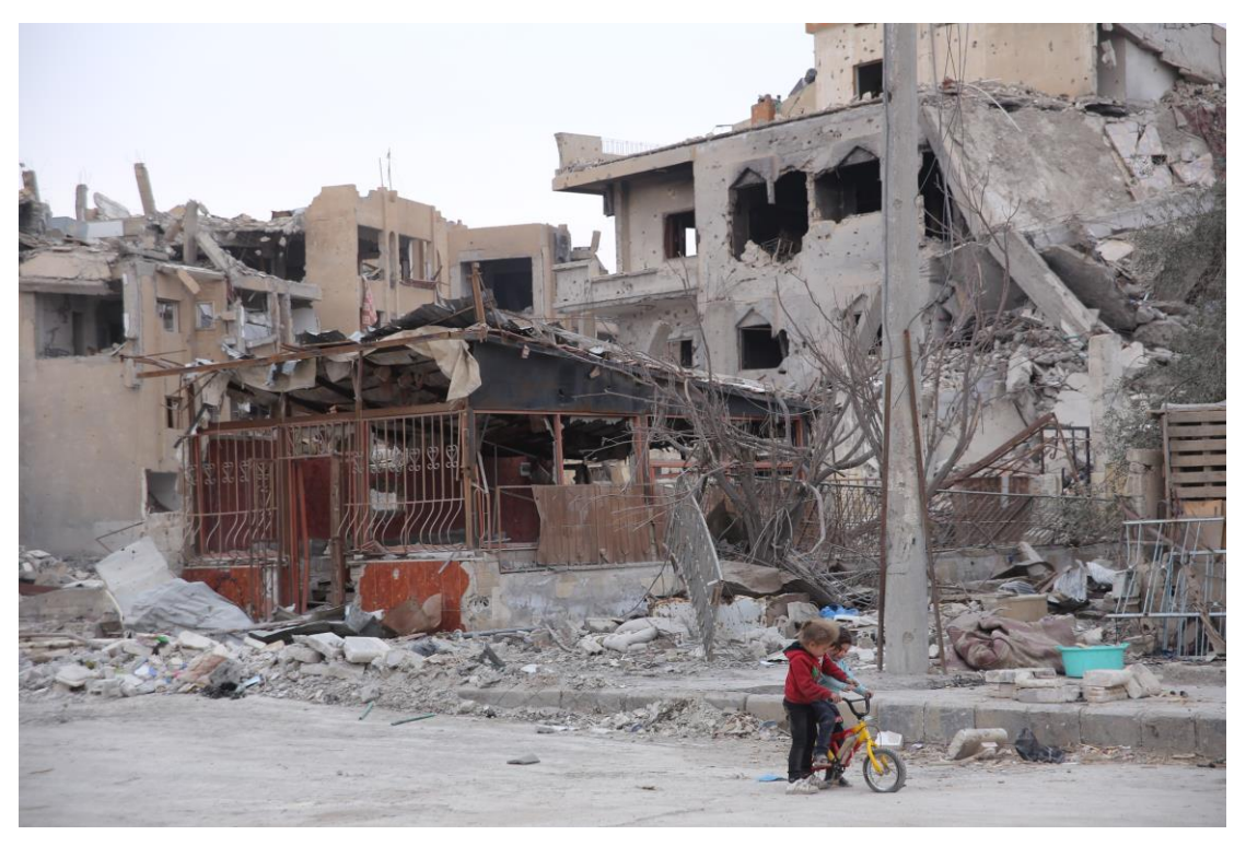
Children riding a bicycle among destroyed buildings in Raqqa.

aware of any Coalition investigators having visited any strike sites anywhere in the city or having interviewed survivors or witnesses of other strikes. Such shortcomings in the investigation methodology appear to be a significant contributing factor to its dismissal of almost all the reports of civilian fatalities and casualties. 122