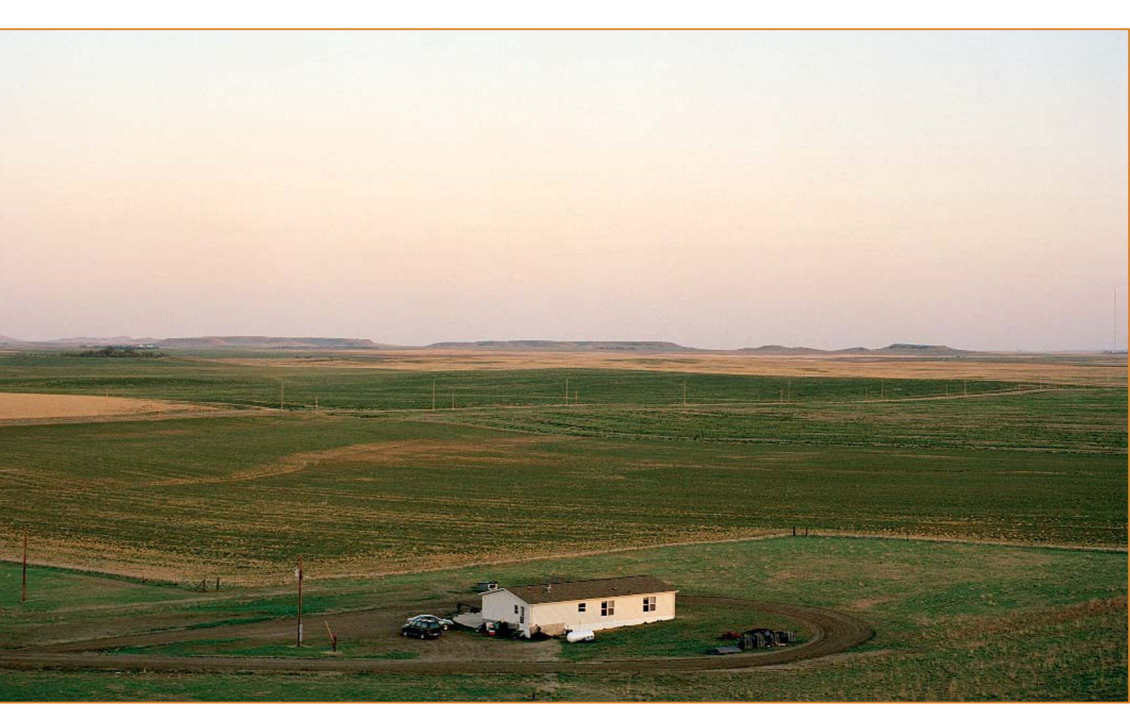
Standing Rock Sioux Reservation, SD