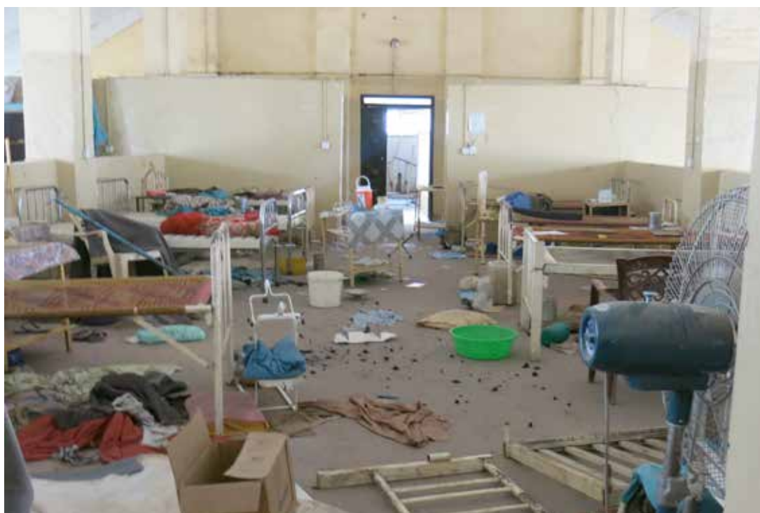
A ward in Malakal Teaching Hospital, where patients and displaced people who had taken refuge were killed by opposition forces in late February 2014. Malakal, Upper Nile state, March 2014.

"She can't manage—she's not normal. She can talk but it's senseless. She quarrels with the children. She cooks, but like a child, she burns things. She knows the children's names, but she does not know their ages. It is the children who tell her to do the things she should do. She can't identify what is happening...Sometimes I pray to God to help her." 51