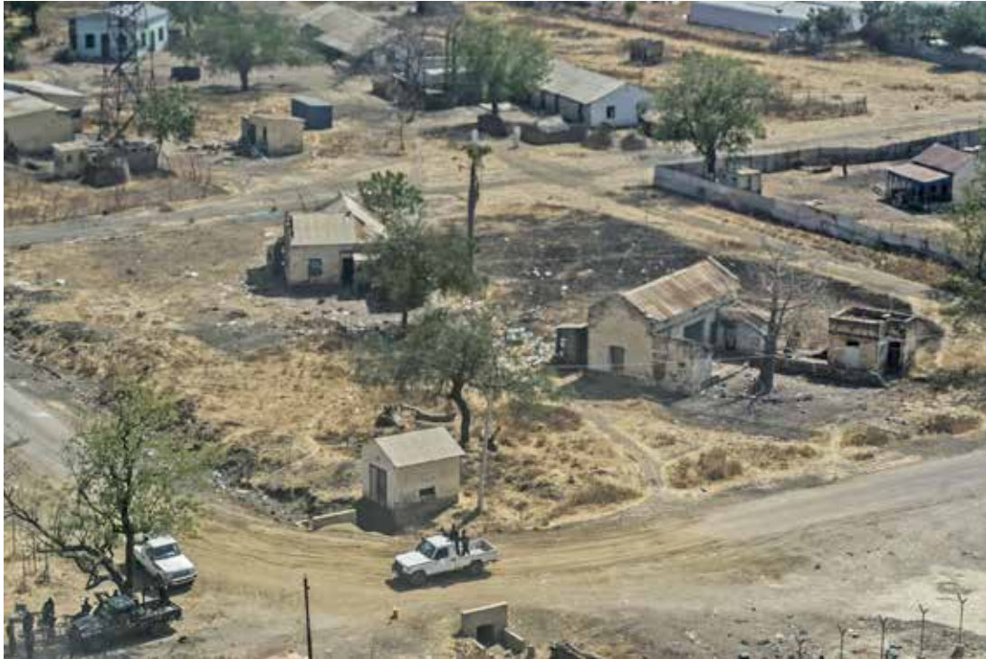
A view of the deserted streets in Malakal, Upper Nile state in January 2014 after residents fled violence between government and opposition forces.

Ajak fled to the Malakal UNMISS base on 25 December 2013, during the first attack on Malakal by opposition forces.