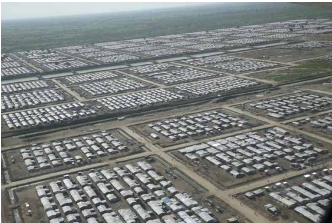
Aerial view of the UNMISS PoC site in Bentiu. June 2016.

Nyawal sought refuge in the Bentiu PoC site in early 2015, escaping an attack on her village in Guit county. She was raped by an SPLA soldier a few months after arriving at the PoC site when she ventured out to buy medicine.