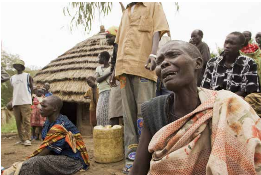
A woman cries following a deadly attack by cattle raiders. Chukudum, Eastern Equatoria state, 2007

The armed conflict that erupted in December 2013 is only the most recent episode of violence in South Sudan's history. From 1956 to 1972 and again from 1983 to 2005, the Government of Sudan and pro-government militias fought against armed groups who sought greater equality and autonomy for the southern regions of Sudan. Both periods of civil war were characterised by extreme violence against civilians, gross human rights abuses, and massive forced displacement. During the second civil war from 1983 to 2005, an estimated 1.9 million people—one out of every five southern Sudanese—were killed or died from disease and famine, and some four million people were internally displaced. 2