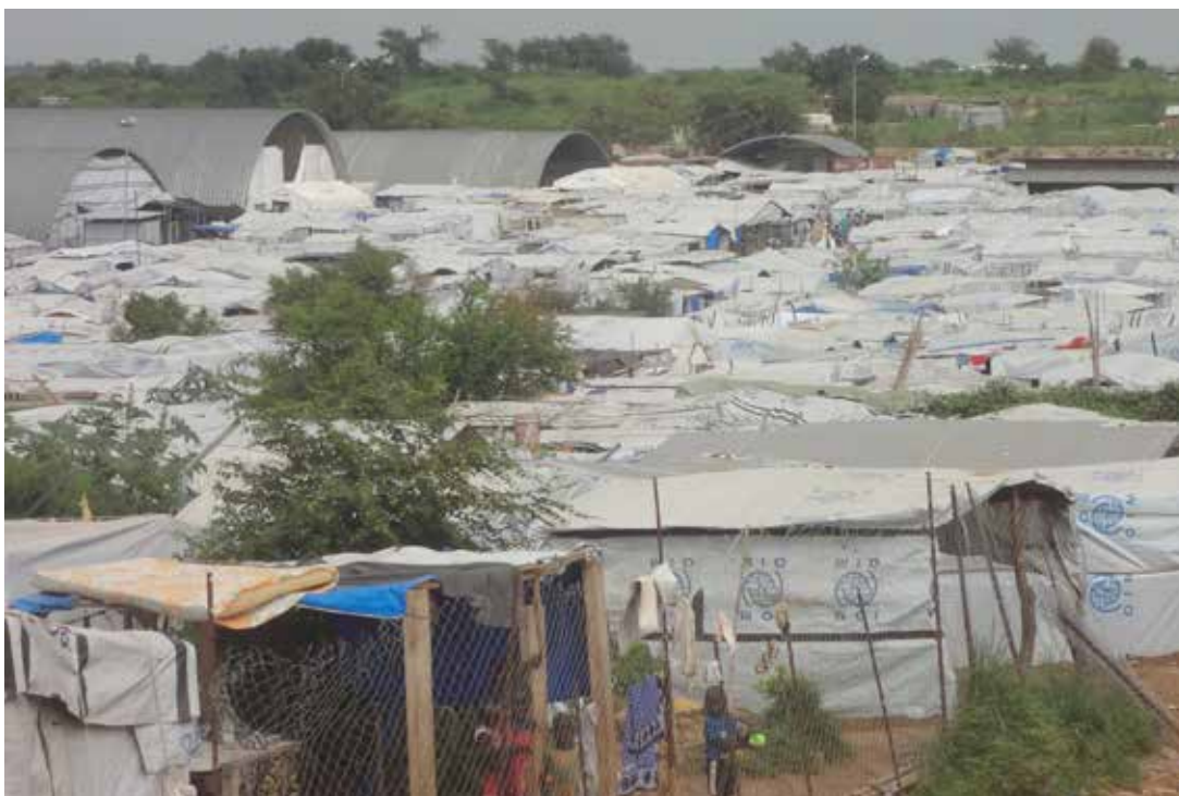
UNMISS PoC site in Juba, South Sudan. 2014

I tried to go to school here but found that I could not concentrate even on the easy things. They just opened a school here, but my thoughts distract me. When I sit still, my mind just goes to other things like my children.”