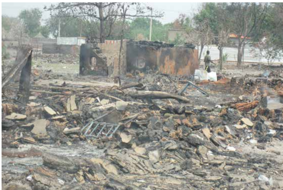
The conflict resulted in the destruction of homes, hospitals, and other buildings. Bentiu, South Sudan, March 2014.

In December 2013, growing political tension between President Salva Kiir and Dr Riek Machar mushroomed into a brutal internal armed conflict. 4 Fighting started in Juba, the capital, where government forces engaged in targeted killings, primarily of Nuer men. Security forces across the country split—with some maintaining allegiance to the government and others defecting to support the armed opposition under Machar, which came to be known as the Sudan People's Liberation Movement/Army-In Opposition (SPLM/A-IO). By the end of 2013, the conflict had engulfed parts of Jonglei, Unity, and Upper Nile states. 5