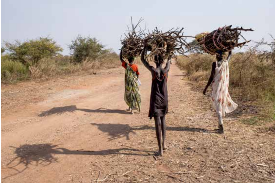
Women returning with collected firewood to the UNMISS PoC site in Bentiu, January 2015.

Nyawal was treated for her rape by Médecins Sans Frontières (MSF) and also received support from the International Rescue Committee (IRC), which provides counselling for survivors of sexual violence in the Bentiu PoC. Her experience caused her significant mental anguish.