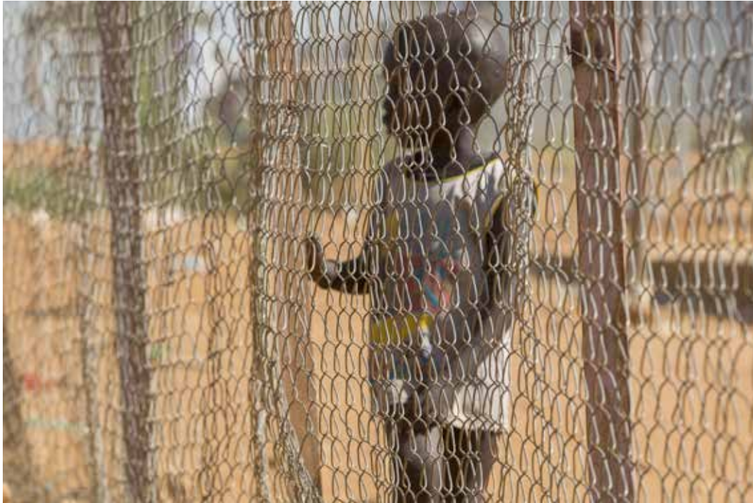
A child at the UNMISS PoC in Juba. 2015

"I am unable to sleep. My wife appears in my dreams. Sometimes she blames me for not performing the required funeral rites...I didn't go to church; I blamed God. When I would go to church I would just cry. My wife used to sing in church. I would remember her voice, how she used to sing."