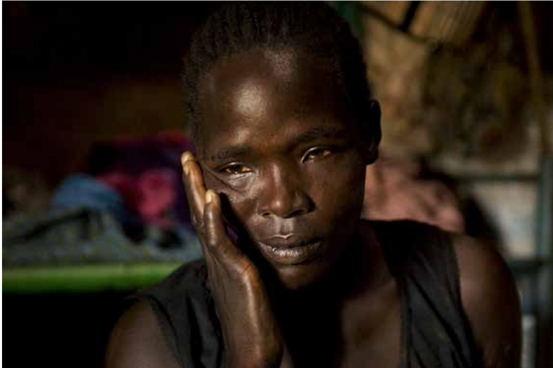
A woman whose husband was killed by an unknown armed group the previous night. Gumbo, Central Equatoria state, 2006