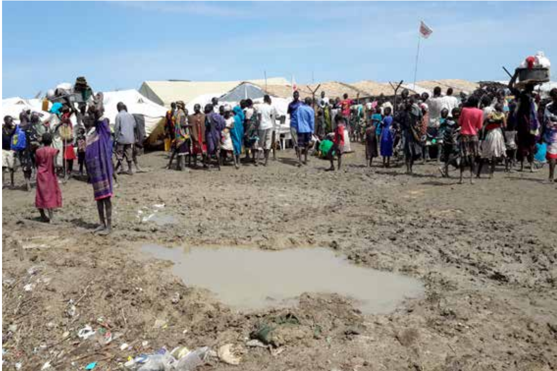
Newly arrived internally displaced people register at UNMISS PoC site in Bentiu, Unity state, May 2015.