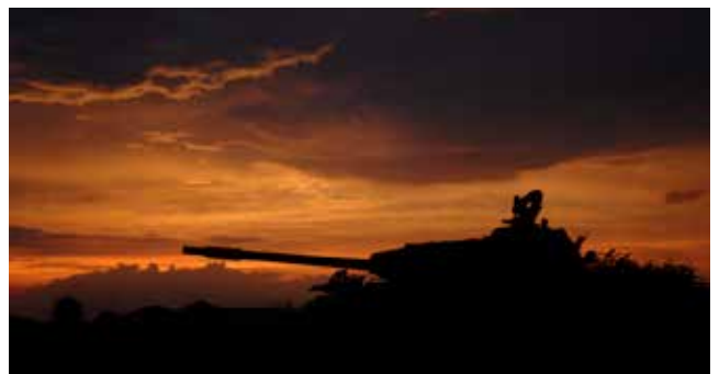
Cover photo: Military tank in Upper Nile state, South Sudan, 2009.