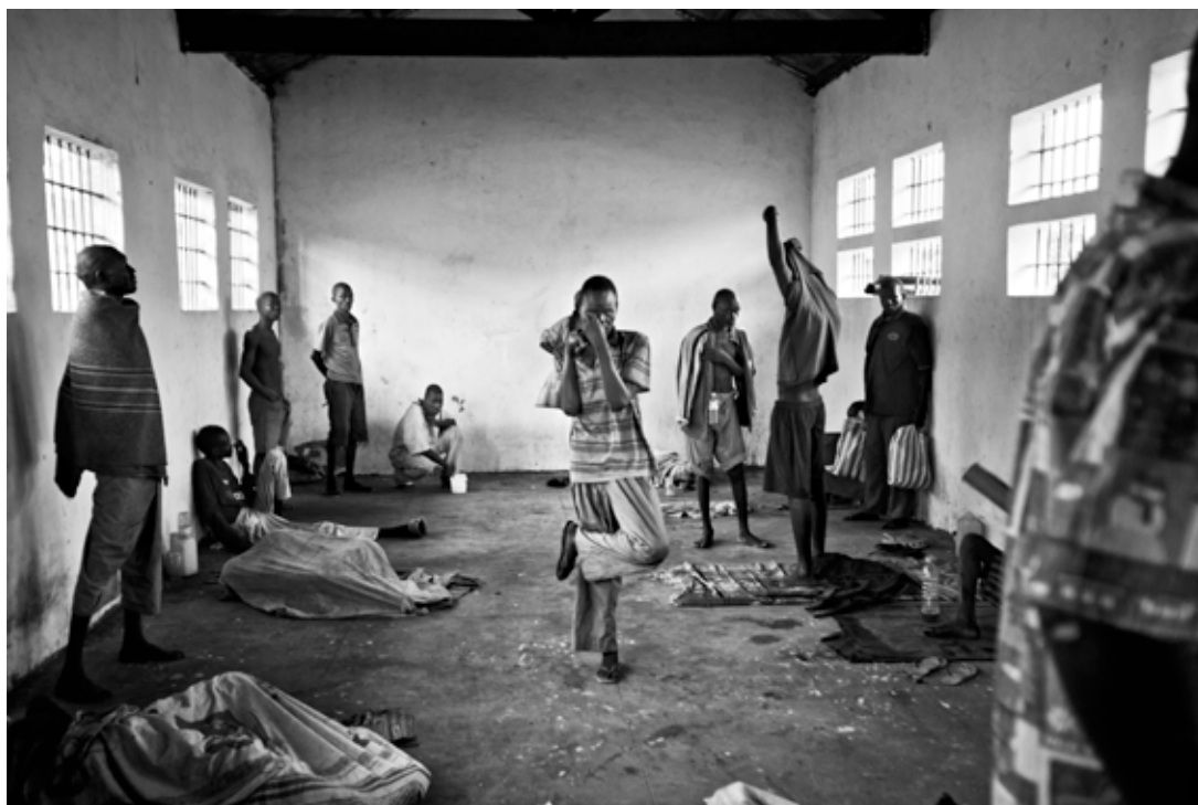
People with suspected mental conditions are routinely detained in prisons. Juba Central Prison, Juba, South Sudan, 2011.

The routine use of prisons to house individuals with mental health conditions is a stark manifestation of the inadequacy of mental health treatment, stigma about mental disorders and the deficit of facilities and trained staff. Individuals with mental health conditions deemed to pose a danger to themselves or others often end up arbitrarily detained in prison, even if they have not committed any crime. They may be transferred to prison from medical facilities or taken directly to prison by family members who feel unable to care for them. In May 2016, there were 66 male and 16 female inmates in Juba Central Prison categorized as mentally ill, more than half of whom had no criminal files. 92 According to a former health worker at Malakal Hospital, prior to the conflict, there were 27 people with mental health problems in the Malakal prison. “Some were brought to prison by family members because they were violent, aggressive, and suicidal,” he explained. 93