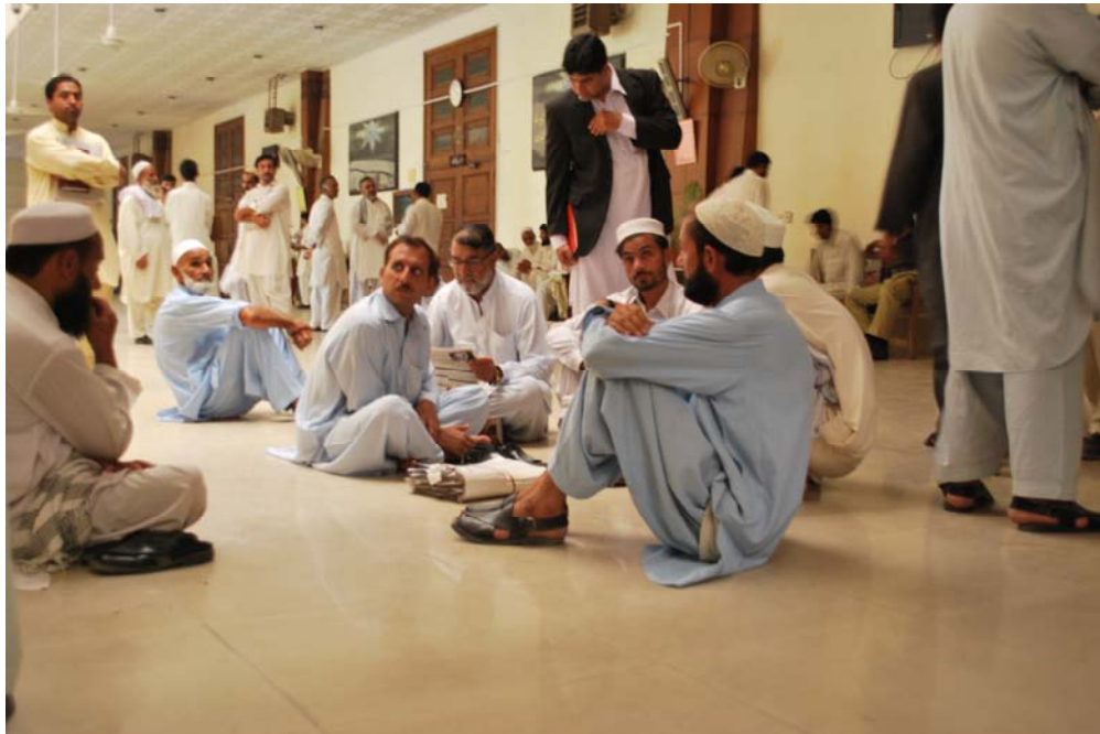
Relatives of men and boys allegedly taken by the Armed Forces in northwest Pakistan wait inside the Peshawar High Court hoping for any information on the fate and whereabouts of their loved ones. 21 August 2012.

international human rights law. The improvements are also rendered almost meaningless by the AACPR.