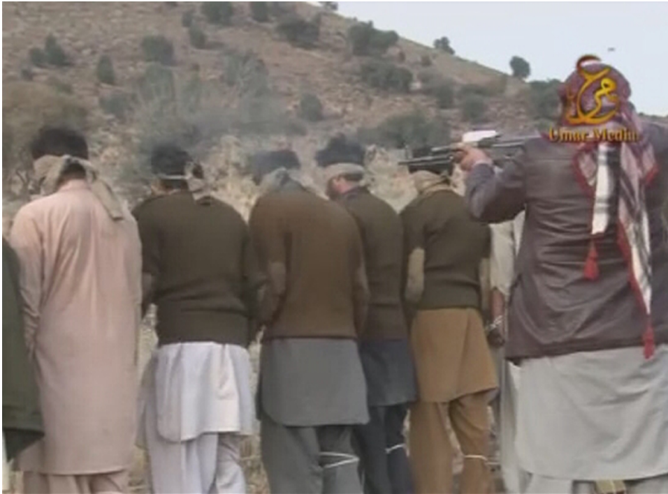
Taliban fighter executes captured Pakistani soldiers on 4 January 2012, the Taliban claims, to avenge the killing of one of its commanders by the Frontier Corps the previous month. The killing of captured soldiers is a violation of international humanitarian law. This still image has been taken from a video obtained by Reuters on 21 January 2012.