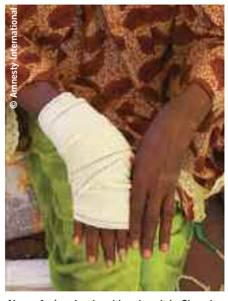
Above: Amina, her hand bandaged, in Choucha refugee camp, Tunisia, June 2011. Her daughter, who is seriously ill, and her six-month-old granddaughter are with her in the camp. Top : Choucha refugee camp, June 2011. The camp is located in an isolated area of desert where conditions are harsh.

Amina, aged 65, Somali refugee, Choucha camp in Tunisia.