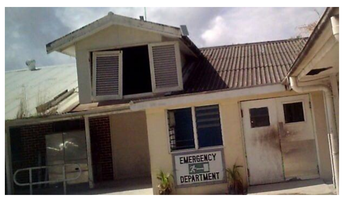
← The Republic of Nauru Hospital.

Another factor contributing to the acute anguish of asylum-seekers and refugees is being denied adequate medical care.