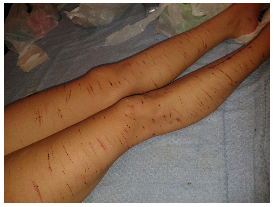
A female refugee on Nauru who has been self-harming.

The evidence of mental health problems and acute distress amongst refugees and asylum-seekers on Nauru is incontrovertible. The factors that drive people to this point are discussed in detail below.