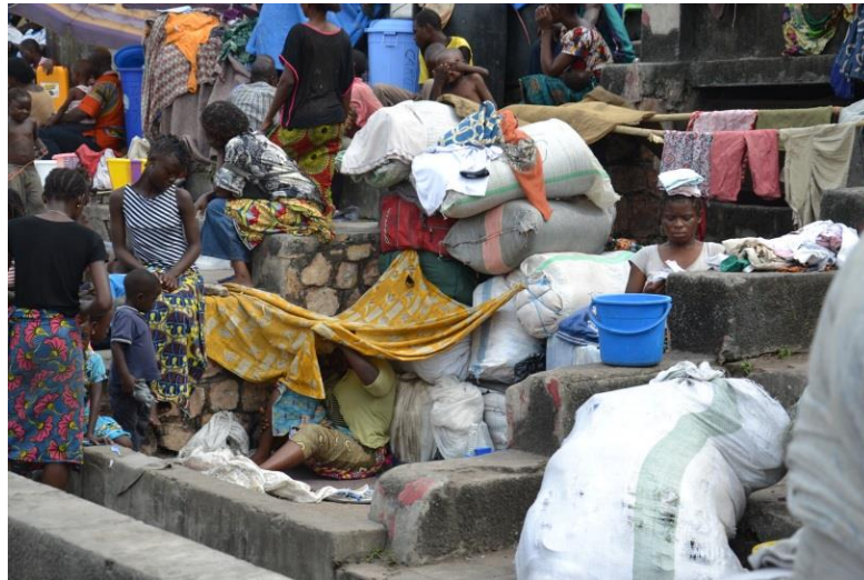
Many of those arriving in Kinshasa were initially sheltered at Cardinal Malula Stadium. Here, a woman uses a piece of fabric as a makeshift shelter.