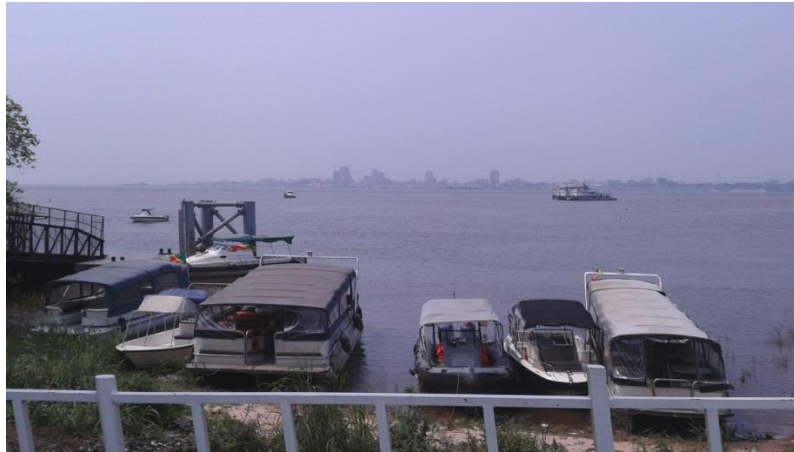
View of Kinshasa from the port of Brazzaville.

Although expulsions are not mentioned as a main line of action in the concept note describing the operation, Amnesty International's research demonstrates that the core of operation Mbata ya Bakolo consisted of mass expulsions of DRC nationals, mostly irrespective of their migration status. According to the government of the Republic of Congo, 158,724 families, that is about 245,000 DRC nationals, returned “voluntarily” to DRC during the operation. 25 According to the DRC government, operation Mbata ya Bakolo resulted in the deportation of at least 179,452 nationals of the Democratic Republic of Congo (DRC). 26 Over 40% of those registered in the DRC (73,614) were minors. At least 60 of them were refugees or asylum-seekers. 27 A number were migrants who were lawfully residing in the country. 28