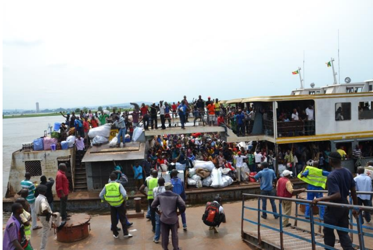
During operation Mbata Ya Bakolo , thousands of DR Congo nationals arrived back in the country every day. While some were able to return with their personal effects, this was not the case for all.

In the case of the Republic of Congo, the human rights violations and abuses committed in the framework of operation Mbata ya Bakolo and outlined in this report caused many DRC nationals to leave the country. Their returns constitute disguised expulsions, in violation of several international law obligations to which the Republic of Congo is bound, including: Article 33 of the 1951 Convention relating to the Status of Refugees; Article 3 of the UN Convention Against Torture; Article 13 of the International Covenant on Civil and Political Rights; Article 2.3 and 5.1 of the African Union Convention Governing the Specific Aspects of Refugee Problems in Africa; Articles 7 and 12 of the African Charter on Human and Peoples' Rights (see below).