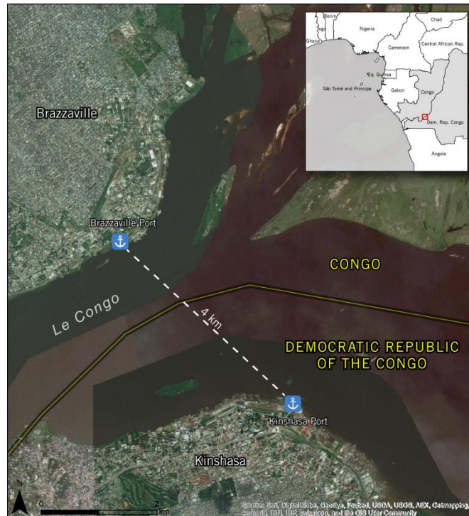
Satellite image showing the distance between Brazzaville and Kinshasa ports.

Cosmos transit site, 23 opened by several UN agencies next to the port. 24 Mass expulsions of DRC nationals ended in September 2014.