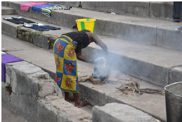
A woman prepares a meal on the terraces of Cardinal Malula Stadium in Kinshasa where many arriving from Brazzaville were initially sheltered.