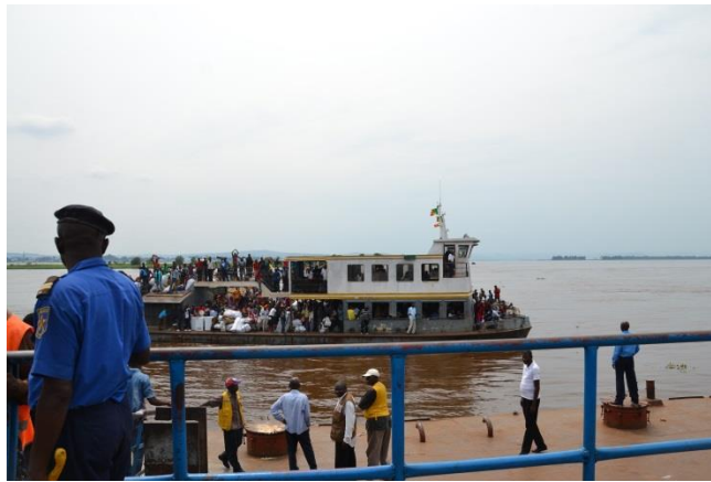
Boats ferried DR Congo nationals expelled from the Republic of Congo. During the peak days of the operation, 7,000 to 8,000 people arrived in Kinshasa daily.

Brazzaville and border crossing to the DRC, from where DRC nationals would take a boat to make the crossing back into the DRC. Those arrested and taken to “the Beach” by the police had no chance to challenge their deportations.