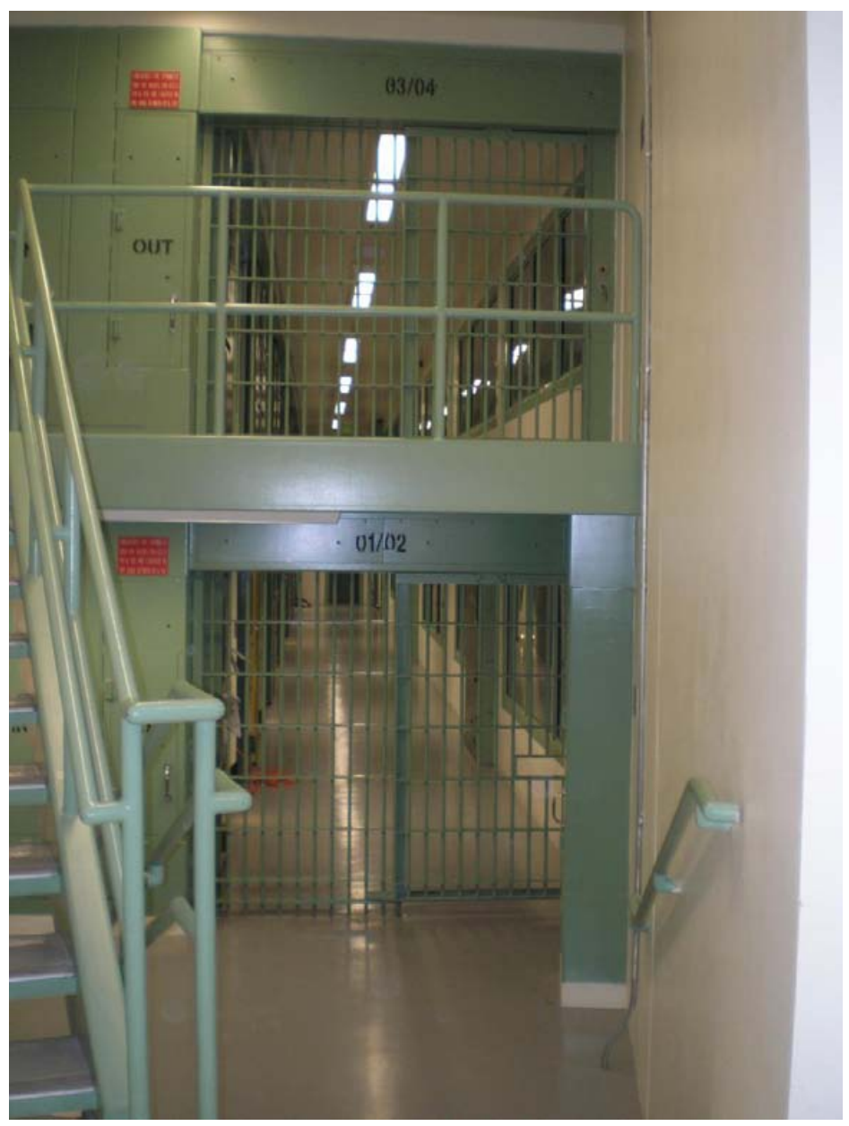
The SHU range in ADX

The Control Unit (CU), together with the SHU and Range 13, are the most isolated units in ADX as prisoners recreate alone and have no contact with anyone other than staff. Prisoners are assigned to the CU for fixed terms for serious offences, usually committed in other prisons, after a hearing which is similar to a disciplinary hearing. The fixed terms can be as long as six years or more,<sup>68</sup> and may be extended if further offences are committed while the prisoner is in the Unit.