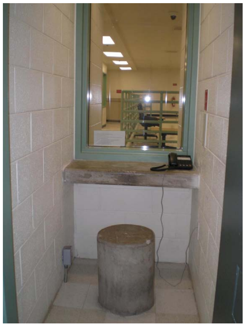
The inmate side of the social visits compartment

Amnesty International believes the degree of restraint applied routinely during non-contact visits appear to be unnecessarily punitive, especially for prisoners who do not have a history of serious rule violations or acts of institutional violence within the facility, and for prisoners needing to communicate with attorneys. International standards provide that restraints should be applied only when "strictly necessary" as a precaution against escape or to prevent damage or injury.<sup>40</sup>