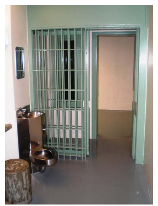
Inside of a cell in the Control unit at ADX

The TU and the Pre-Transfer Unit were both originally sited at the ADX facility but are now located at USP Florence, a high security prison which, like ADX, forms part of the Federal Correctional Complex (FCC) at Florence. ADX itself has therefore become almost entirely a "lock-down" facility in which prisoners are locked in solitary cells for all but a few hours a week. Amnesty International is concerned that, at a time when there is growing recognition of the damaging effects of isolation and moves to restrict such practice in some states, conditions in ADX have become more restrictive in recent years.