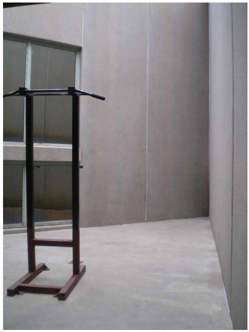
An outdoor recreation area in the Control Unit at ADX \odot Private

According to BOP regulations, prisoners may have their exercise in the larger yards suspended for three months at a time for a single rule violation, with increased suspensions for further offences.<sup>27</sup> It is alleged that prisoners are sometimes punished for minor rule violations, such as in one case for feeding crumbs to birds.<sup>28</sup> The regulations list violations for which the yard exercise can be suspended as including "sexual acts or gestures, suicidal attempts or gestures, smearing or throwing human waste".<sup>29</sup> Amnesty International is concerned that prisoners who have not committed serious violations, or whose behaviour may be indicative of mental health or behavioural problems, should have their outdoor yard exercise -- and thus their only limited association with other inmates -- withdrawn for such extended periods. It urges that this rule be reviewed.