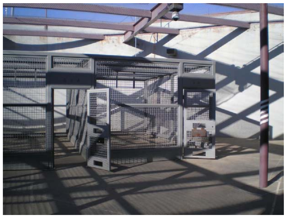
An outdoor recreation cage for prisoners in the Step Down Program at ADX \odot Private

GP prisoners are allowed up to ten hours out-of-cell exercise a week, in two hour slots five days a week, alternating between indoor and outdoor exercise. Prisoners always take indoor exercise alone, in a windowless room with only a pull-up bar. Outdoor exercise takes place either in an enclosed solitary yard attached to the unit or in one of five individual cages in a larger yard. The only time a prisoner can communicate directly with another inmate is when conversing with a prisoner in an adjacent cage, an opportunity which takes place, at most, on two or three days a week.