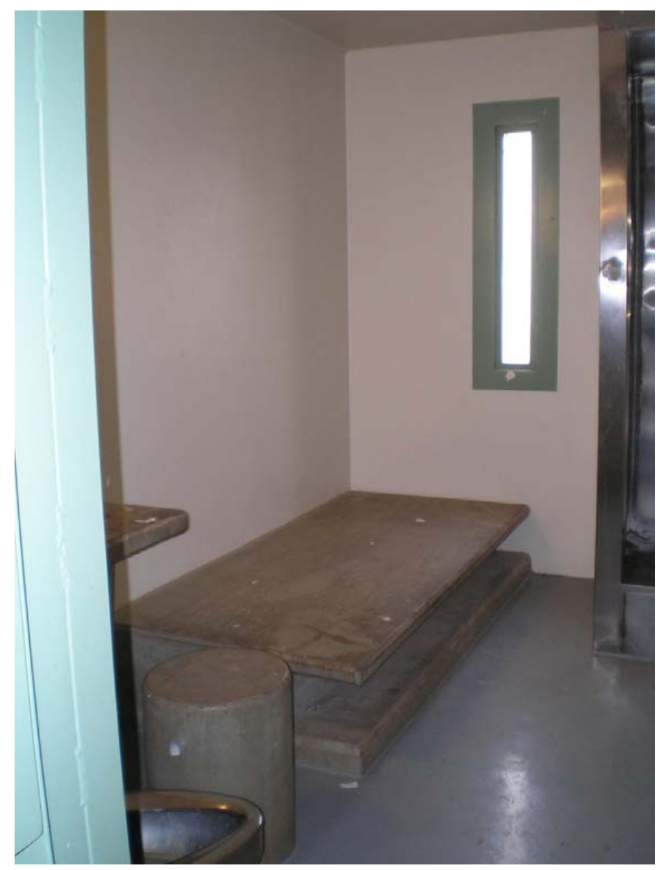
Interior of a SHU cell at ADX

Prisoners in the CU have no access to the SDP but they can receive monthly credits for positive behaviour which can reduce their terms; they may also lose credit for disciplinary offences or failure to adjust. ADX regulations require that all prisoners receive monthly reviews by a CU Team attended by a psychologist. An Executive Panel reviews each CU case every 60-90 days to determine an inmate's readiness for release (to another prison or to the ADX GP).<sup>69</sup>