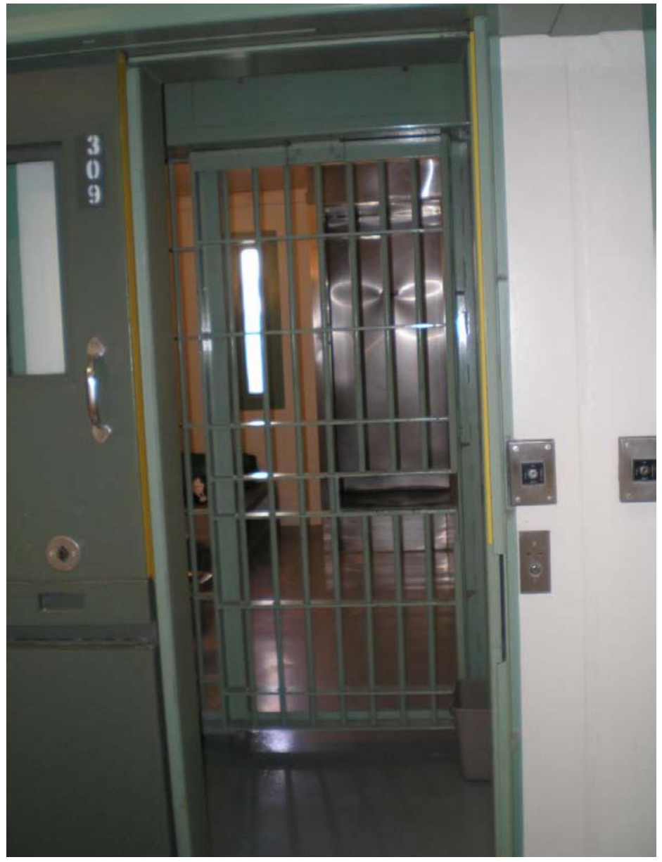
Inner door of a General Population cell at ADX, picture taken from the corridor

While Amnesty International's delegate recognized that there were a number of in-cell programs available at the time of her 2001 visit, these cannot compensate for the prolonged cellular confinement and social isolation experienced by ADX prisoners for many months or years, or even indefinitely. The value of in-cell programs becomes more questionable the longer a prisoner is held in isolation and unable to interact meaningfully with others. Prisoner advocates have also reported that, apart from some basic educational courses such as GED (which are required by a minority of inmates), there is not much structured educational or rehabilitative programing leading to formal qualifications or defined outcomes or goals.<sup>35</sup>