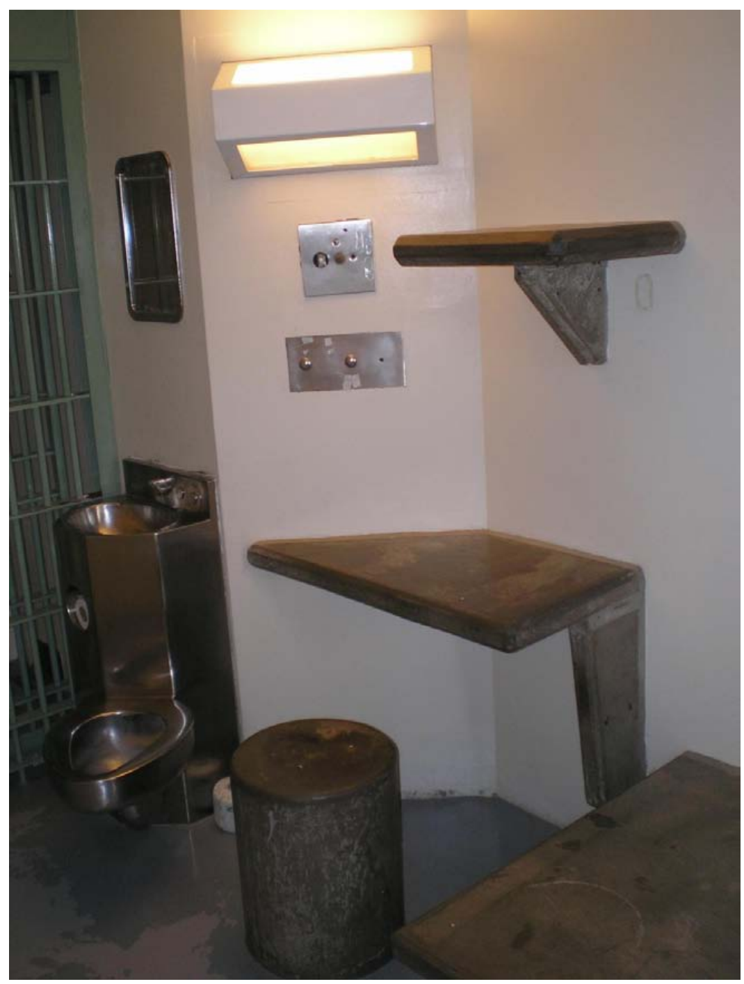
The inside of a cell in a General Population Unit at ADX

The vast majority of prisoners are allowed out of their cells for only a few hours a week, for exercise, occasional visits to a "law library" cell, social or legal visits, or for some medical consultations.<sup>26</sup> All meals are delivered to and eaten inside the cells. As Amnesty International has observed elsewhere, there is concern about the possible health risks from spending so much time in a confined space, and eating all meals in close proximity to the open toilet. Prisoners are placed in full restraints and are accompanied by two guards when being escorted out of their cells. Otherwise nearly all contact with staff takes place either remotely (e.g. through medical teleconferencing) or at the cell front.