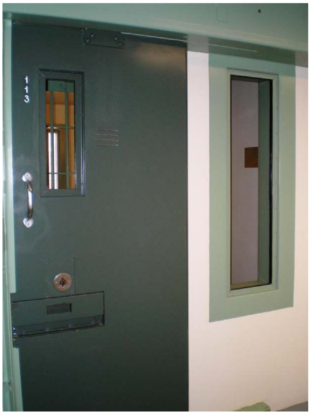
Outer door of a cell in the Control Unit at ADX, picture take from the corridor

A stipulated court agreement in 2008 provided that an Imam visit ADX four times a month to speak with inmates individually. Prison attorneys have reported that since there is no longer an Imam on site, inmates in the past few years have received far fewer visits from an Imam than the limit set in the court agreement.<sup>33</sup>