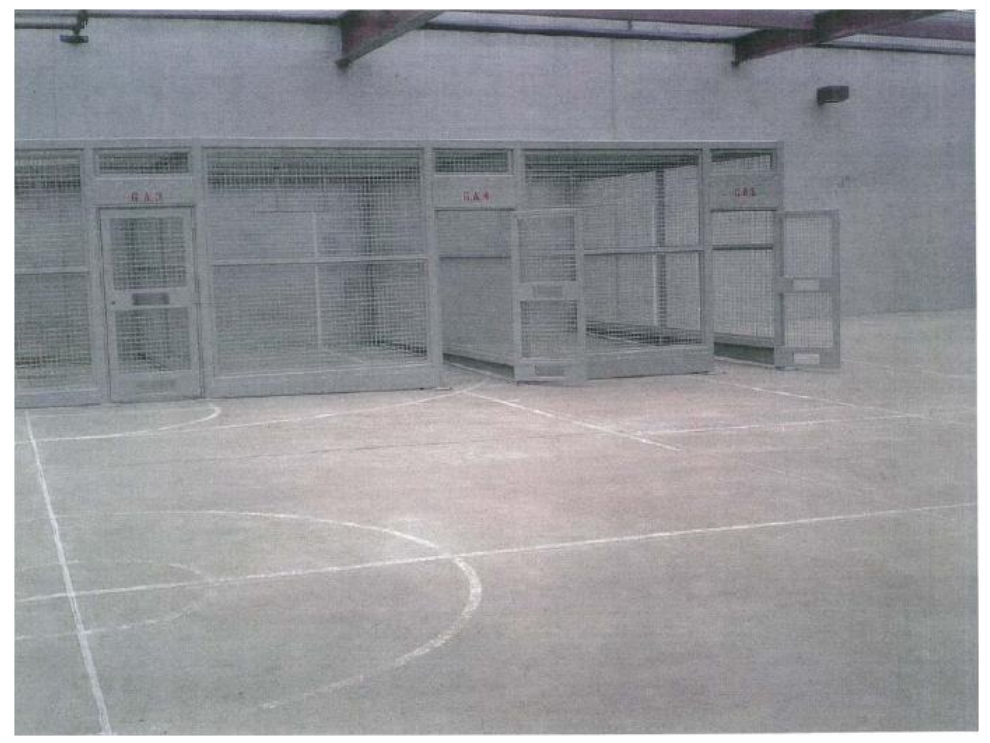
Outdoor recreation cages at ADX \ensuremath{\textcircled{O}} Private

group interaction. As described below, prisoners in the step-down program also have significantly less association and out of cell time than previously. According to a lawsuit, more could be done to ensure the safety of prisoners in group recreation.<sup>32</sup>