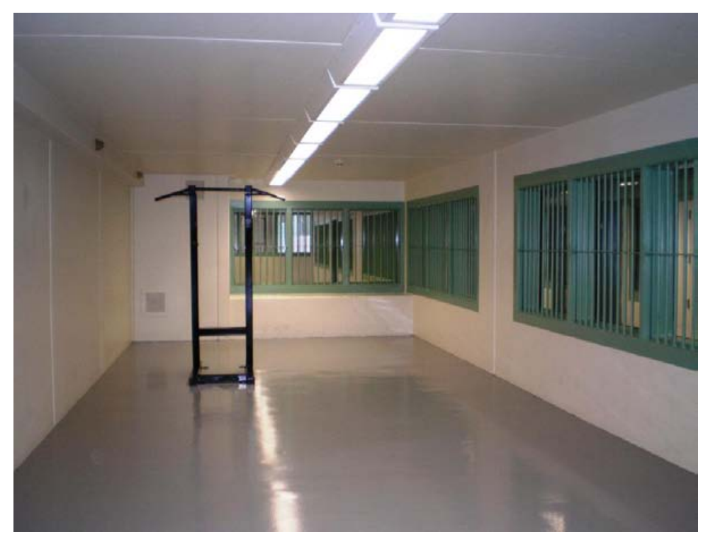
Indoor recreation area in the Control Unit at ADX

The opportunity to exercise is particularly important for the physical and psychological wellbeing of prisoners who are cut off from normal activities and are confined to cells for prolonged periods. Neither the cages nor the enclosed individual yards in Amnesty International's view meet the standard of "suitable exercise in the open air" as provided under the SMR, nor, under the present regime at ADX, is outdoor exercise provided to each prisoner daily.