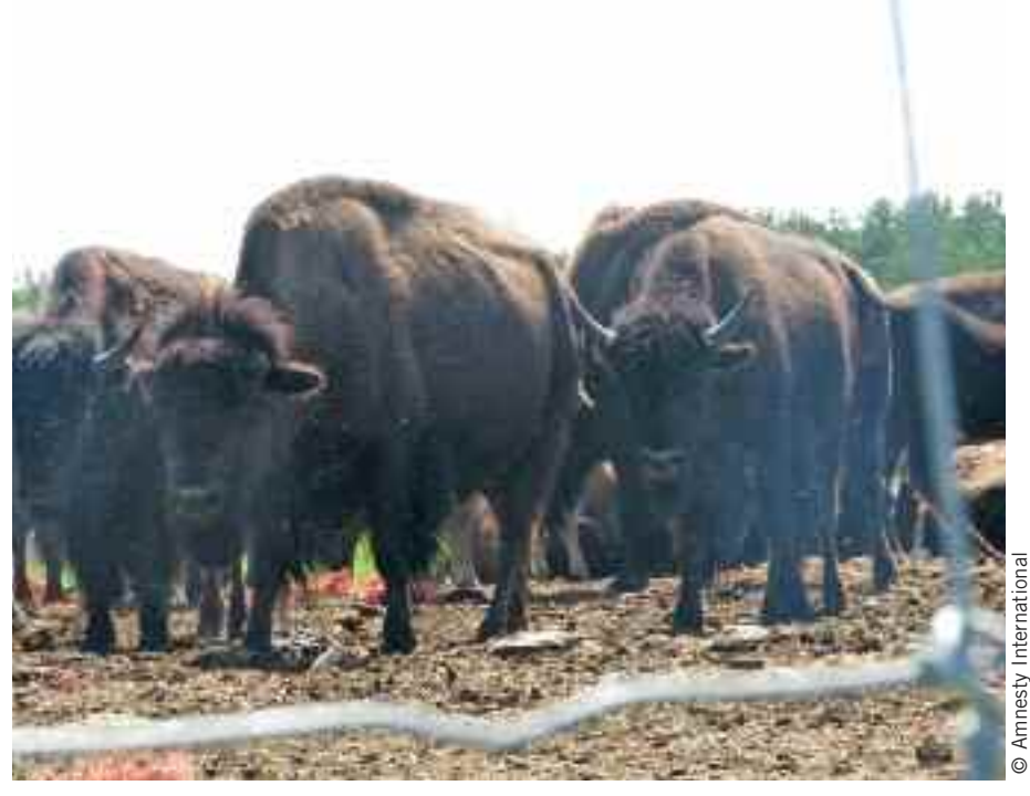
Above: The Lubicon are raising a domestic bison herd as a replacement for the loss of traditional sources of food. Cover: A disused Lubicon trapper's cabin overshadowed by an oil well, 2008.

There have been five rounds of talks between the Lubicon and the federal government since 1986. At several points during these talks, a negotiated settlement appeared to be close at hand.. The last round of negotiations broke down in 2003 after federal representatives said they didn't have a mandate to further negotiate long-standing issues of financial compensation and self-government.