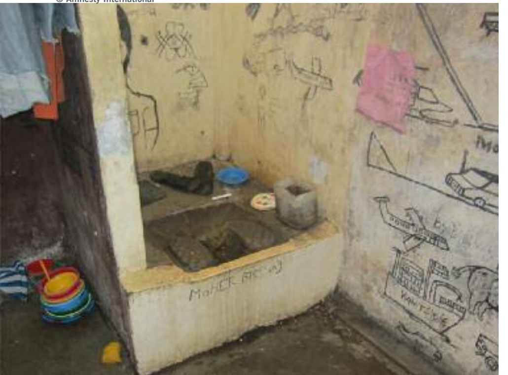
Top: The communal bathrooms at Monrovia Central Prison are dark, wet and dirty. There isn't enough water for the inmates to bathe with any regularity, and there is no plumbing.

Above: The latrines in the cells for boys under 18 at Monrovia Central Prison are dirty and offer no privacy. Many complained that cockroaches come out of the toilets.