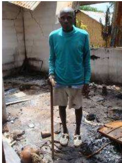
81 year old man in remains of his house burned in Gobroko on 9 May 2011