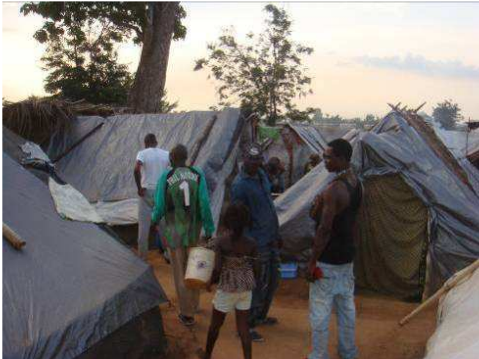
Liberian Refugee Camp, Guiglo, June 2011

Liberian refugees have been targeted for widespread reprisal attacks, particularly after the 2002 armed uprising and again since the resumption of the violence after the November 2010 presidential election, largely because some Liberians were recruited as mercenaries at different times during the last decade by all the parties to the conflict. These mercenaries have been responsible for crimes under international law and serious human rights abuses. During each of the three fact-finding visits to Côte d’Ivoire since the beginning of 2011, Amnesty International has interviewed numerous Liberian refugees among a group of 600 in a camp beside the UNOCI base in the town of Guiglo, in the west of the country. One leader of the community told Amnesty International in June that: