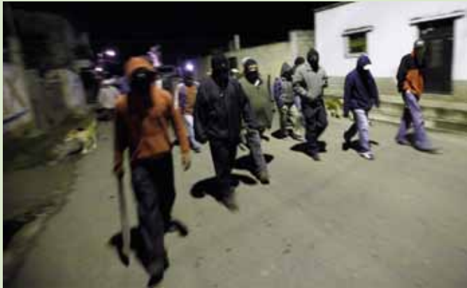
Carrying shotguns and machettes, a citizen security patrol walk the streets of 'Barcenas' in Guatemala City Sept. 5, 2007.

military type pistols and revolvers 39 worth $18.1 million according to declarations made by the 14 States declaring these exports. 40 However, Guatemala reported the total value as $26,6 million imported from 32 countries, according to Guatemala import declarations. 41 In the exporter declarations, the total amounted to an annual average of $1.8 million and in Guatemala's import declarations, there was an annual average of $2.7 million.