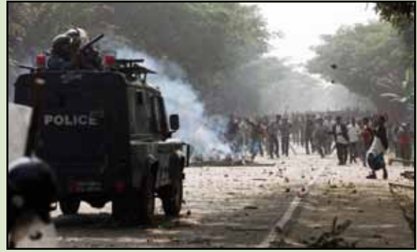
Villagers throw rocks at a police van during a clash in Munshiganj, Bangladesh, during protests against government plans to acquire land for a new airport, January 31, 2011.

Union states reported 90 that they exported to Bangladesh military equipment valued at €555,000 (of which €414,000 was from Czech Republic, including helicopters) and licensed for export military equipment for €4.4 million (the main EU suppliers were: Italy, Belgium, Czech Rep., and Poland). In 2007, EU countries exported to Bangladesh military equipment valued at €4 million (of which €2.7 million was from Italy) and licensed exports for €5.9 million (the main suppliers were: Italy, Austria, Slovakia, and Poland). In 2006, EU exports reached €2.2 million (of which €1.3 million was from the Netherlands for fire control equipment) and licenses for definitive arms exports for €5.5 million (of which €2.2 million was issued by the United Kingdom and €1.9 by the Netherlands).