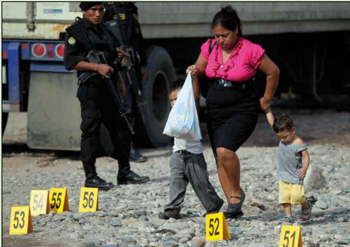
A mother and her children walk through evidence markers at the scene of a deadly shoot out near Zacapa, Guatemala Sept. 23, 2010.