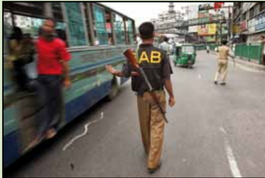
A Bangladesh special forces 'Rapid Action Battalion' soldier guards a street in Dhaka, Bangladesh, Nov. 9, 2005.

On the morning of Sunday 12 December 2010, at around 8:00 am, thousands of garment workers employed in a South Korea-based company in the Chittagong Export Processing Zone (CEPZ) 62 found a lockout notice for an indefinite period hanging at the gates of the factory. 63 The workers started a demonstration and were soon joined by other workers of the CEPZ, asking for the implementation of a wage increase that some employers failed to apply. 64 The wage increases had been agreed in the summer, following several weeks of protests, and the government had promised the increases would