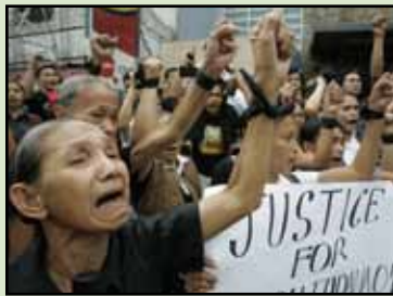
Sympathizers grieve as they clench their fists during the arrival of one of 30 massacred journalists at UNTV media headquarters in suburban Quezon city, Philippines, Dec. 2009.

On the morning of 23 November 2009, at about 9:00 am, a convoy of seven vehicles 107 left the town of Buluan in Maguindanao, a province in the southern Philippine island of Mindanao. The convoy was bound for Maguindanao's capital, Shariff Aguak, to file a certificate of candidacy for governor of the province in the May 2010 election. The convoy included 37 journalists, invited to cover the event.