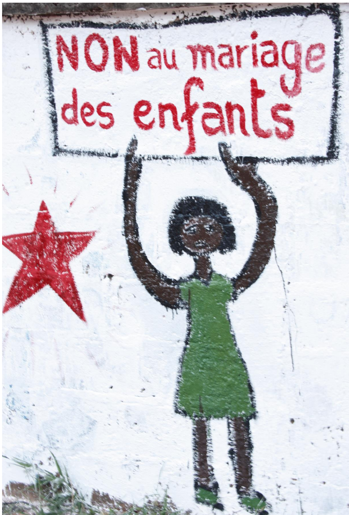
Painted wall in Bobo Dioulasso saying "No to child marriage" near the Maïa association which works on sexual and reproductive rights.