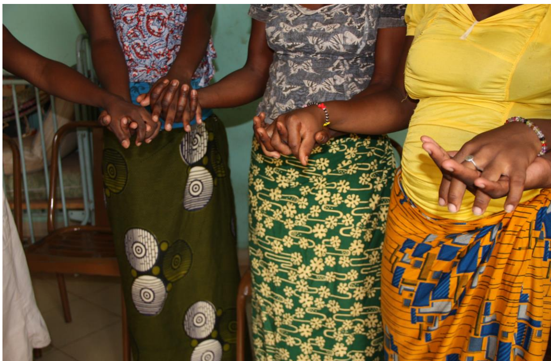
Young women hold hands in a shelter run by nuns in Ouagadougou, July 2014.