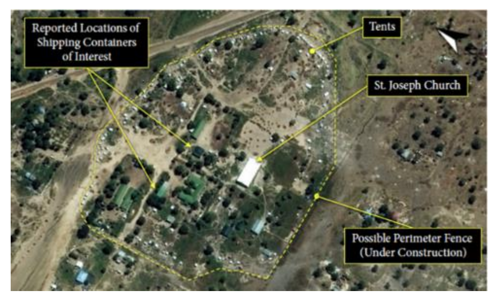
Satellite image of the Comboni Catholic Church compound where detainees were held by government forces.

Witnesses most consistently told Amnesty International researchers that they saw the detainees who subsequently died being held in the red container on the side of the compound used by the Comboni Sisters. The then-commissioner of Leer County, who was not present in Leer during the incident, told Amnesty International researchers that he subsequently requested an internal report about the killings. He told Amnesty International researchers that he was told the detainees who died were held in the red container on the Comboni Sisters side of the compound. Some witnesses however, said that the detainees who died were in a blue container or in a red container on the Brothers' side of the compound. All of the containers that witnesses described did not have any visible air holes or ventilation systems. Amnesty International was not able to determine whether the detainees who died were held in different containers on the church compound, but it is clear that at least some of these detainees died in the red container on the Sisters side of the church compound.