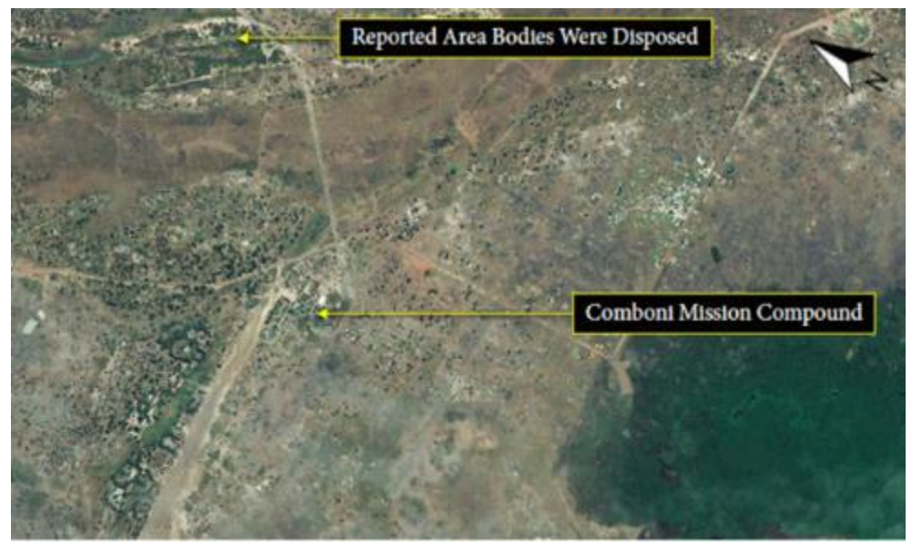
Satellite image of Leer.

Amnesty International spoke to 12 witnesses who visited Kulier, in Juong payam, in the days and weeks after government soldiers reportedly dumped the bodies of dozens of detainees held in a container there. The witnesses described the bodies as being in two pits in Kulier, which is one kilometer to the northeast of the Comboni Catholic Church compound.