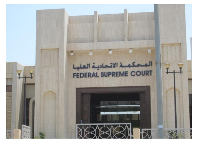
Federal Supreme Court, Abu Dhabi, UAE.

The Federal Supreme Court, whose judges are appointed by executive decree, has shown itself to be neither independent nor impartial when trying cases brought largely under broad and sweeping national security provisions in the Penal Code or the cybercrimes or counter-terrorism laws. Trials