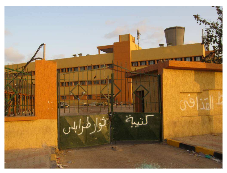
Detainees at the Ali Ureit School in Tripoli, pictured above, complained of beatings

"They beat us several times using their rifles. They also whipped us. When they transferred us to Mitiga [airport detention facility], they forced us to walk on our knees to the vehicles while they insulted and beat us. They accused us of being mercenaries."