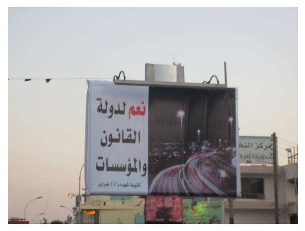
Poster in Benghazi: "Yes to a country of law and institutions"

The NTC faces considerable challenges in its efforts to reform the judicial system and control the numerous armed militias that have largely taken the law into their own hands. In a period of transition, it is imperative that the NTC firmly demonstrate its commitment to turning the page on decades of gross and systematic violations in Libya. It must uphold human rights in Libya and exercise the necessary political will to investigate abuses committed by anti-Gaddafi forces, prosecute those responsible, and ensure that individuals found guilty of abuses are held to account for their actions and removed from positions that would allow them to repeat such abuses. The NTC must also send a strong signal to its supporters including through further public appeals - and to the public at large that torture and other illtreatment will not be tolerated and that the same human rights standards will be applied to its supporters and its opponents.