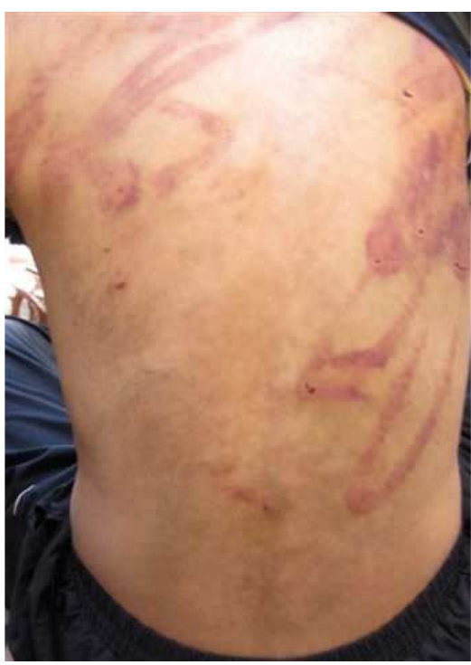
Detainees in Tripoli show Amnesty International their scars