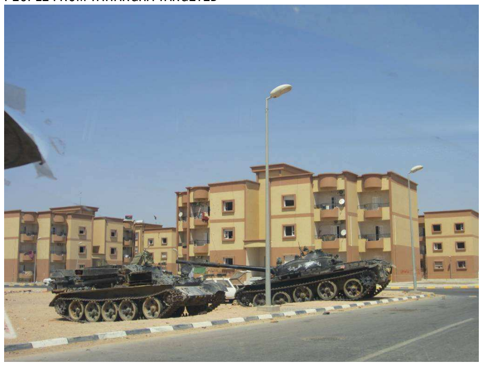
Tawargha deserted, September 2011

People from Tawargha region, who are black Libyans, have been at particular risk of reprisals and revenge attacks by thuwwar from Misratah because the region was a base for al-Gaddafi troops when they were besieging Misratah and reminds Misratah residents of serious violations by al-Gaddafi forces. The town of Tawargha was deserted when Amnesty International visited it on 16 September, its residents having fled to various cities across Libya in search of safety.