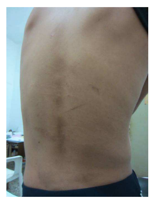
Detainee in Tripoli shows Amnesty International scars as a result of beatings, September 2011

When Tripoli and its suburbs first came under NTC control, captured individuals were detained in makeshift detention centres, including Ali Ureit School and a football club in al-Madina al-Kadima, where detainees were particularly vulnerable to torture and other ill-treatment. There have since been efforts to hold people in official facilities such as Jdeida Prison and Ain Zara Open Prison.