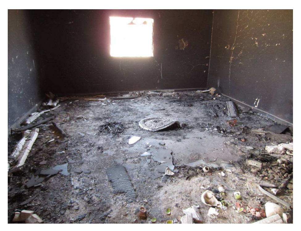
Burned home in Tawargha, September 2011

Two other men from Tawargha, who were being held in a detention facility in Tripoli, told Amnesty International that they were seized at their home in Tripoli on 28 August. One of them, the owner of the house, told Amnesty International that a group of five armed men barged into the house, searched it, and took him and one of his relatives. The other man had fled Tawargha along with 11 other relatives in mid-August. He continued: