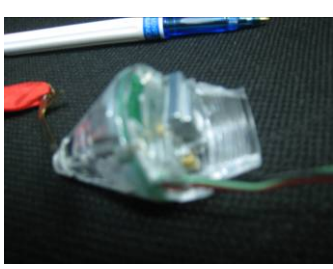
Top and above, safe / arming devices for the MAT 120 cluster munition.