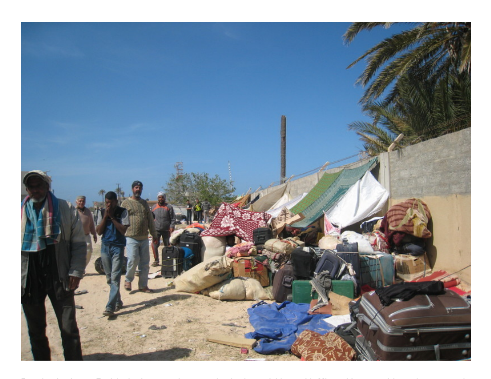
Egyptian (and some Tunisian) migrant workers camping by the roadside outside Misratah's port waiting to be evacuated, Libya, 15 April 2011.

Since the beginning of the conflict, some 500,000 foreign nationals have fled or have been evacuated from Libya, including from Misratah. Others have been unable to escape up to now, and have remained trapped in the besieged city. According to the International Organization for Migration (IOM), over 8,000 migrants were living at the city's port in April in dire conditions and urgent need of humanitarian aid. At the time of writing, IOM had evacuated over 5,000 people, mostly migrants but also injured Libyans, since 14 April, but was reporting that thousands of others continued to be trapped and in urgent need of assistance.<sup>10</sup>