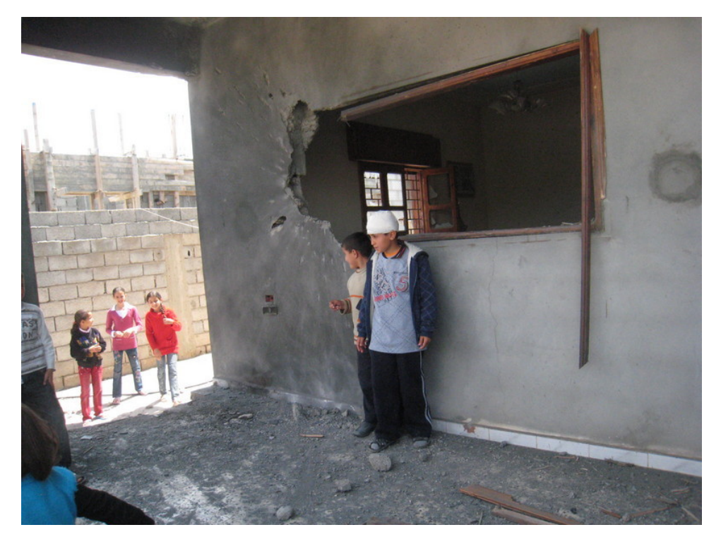
Several residents were injured, including two children, when a mortar struck this house in Gheiran neighbourhood

By the second week of March forces loyal to Colonel al-Gaddafi had set about re-establishing control over parts of the city they had earlier evacuated, moving tanks and heavy military vehicles into Misratah's residential areas and placing snipers in tall buildings in the city centre including the Ta'min (Insurance) Building on Tripoli Street.<sup>5</sup>