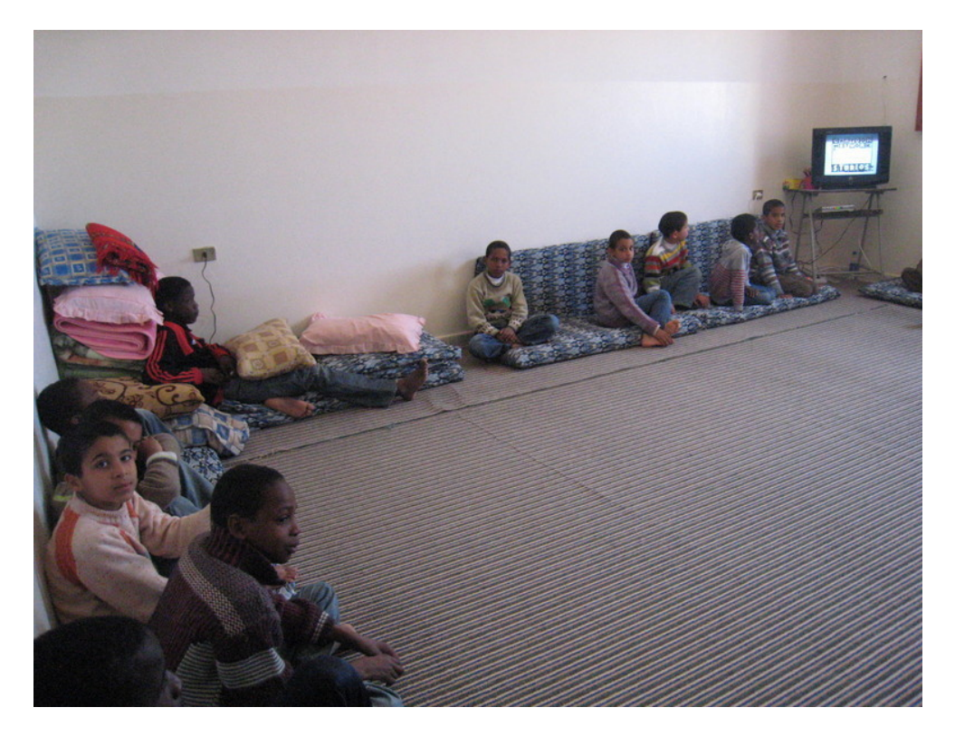
Children from the orphanage now sheltering in a school, 19 April 2011.