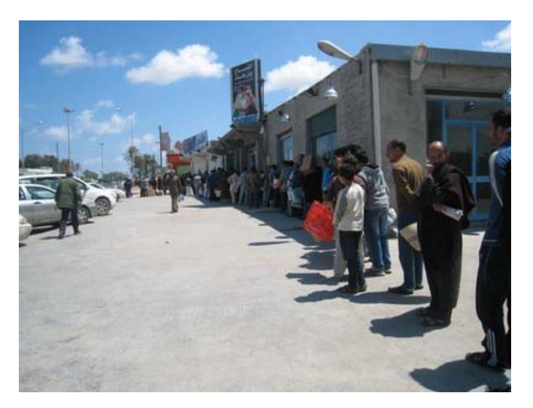
A queue for bread in Misratah

On 26 February, the situation in Libya was referred to the International Criminal Court (ICC) by the UN Security Council under Resolution 1970. On 4 May ICC Prosecutor Luis Moreno-Ocampo informed the UN Security Council that in a few weeks he will request the judges of the International Criminal Court to issue arrest warrants against three individuals for crimes against humanity committed in Libya since 15 February 2011.<sup>40</sup>