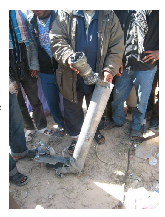
Egyptian migrants show a Grad rocket which landed nearby, 15 April 2011.

Five other Egyptian migrant workers, who had been stranded with thousands of others near the port entrance desperately waiting to be evacuated since the beginning of the conflict, were among those killed in the bread queue on 14 April