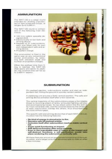
Company brochure acquired in 2001. Sourced through Mispo.org. © Mispo.org

Leaflet warning about UXOs (unexploded munitions) at a hospital in Zawia al-Mahjoub neighbourhood in Misratah, April 2011. The same leaflet was displayed elsewhere in town. © Amnesty International