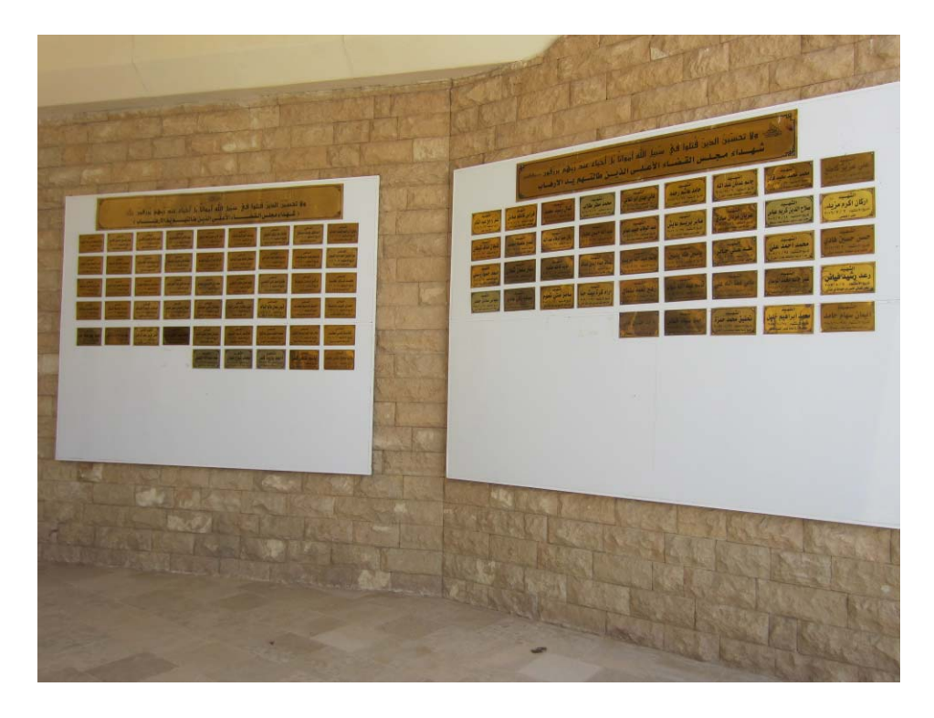
Plaques in memory of scores of judges and prosecutors who have been killed in attacks over the past decade in Iraq, fixed to the wall at the entrance of a judicial building, Baghdad, September 2012.

The executive branch of government, through its actions, has continued to directly undermine key rights, such as the right to fair trial – for example, by allowing terrorism suspects' "confessions" to be broadcast on television even before those suspects come to trial. In some cases, senior government leaders have publicly pronounced individuals' "guilt" to capital charges either before they have been tried or before their trials have concluded.