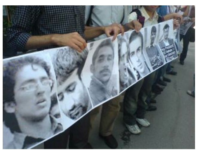
Student protest at Amir Kabir University in support of imprisoned students.

Many formerly detained students have alleged that security officials blindfolded and beat them at the time of their arrest and when they were being transported to their initial place of detention, and that they were then subjected to torture and other illtreatment during interrogation in order to extract "confessions". The most common methods cited include severe beatings; the application of electric shocks to various