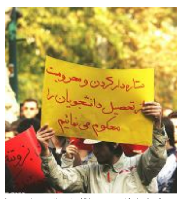
Demonstration at the University of Tehran on national Student Day, 7 December 2006. The banner says "We condemn 'starring' and banning of students from education".

At the Iran University of Science and Technology in Tehran in 2011, the Dean of the Civil Engineering School and head of the university's Academic Basij, reportedly barred 15 female students from registering for the new semester for failing to attend mandatory briefings on "hejab and chastity" (hejab va efaf) that he convened, and warned other female students that they would be punished if they failed to comply with the hejab and chastity regulations. 139