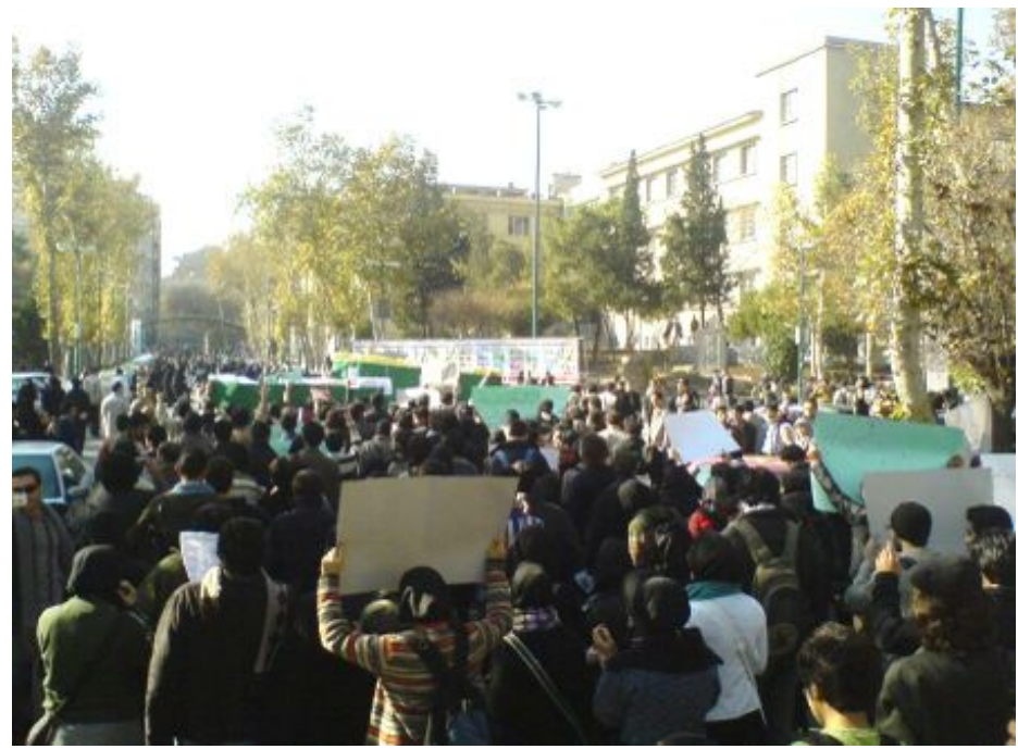
Demonstration at the University of Tehran on national Student Day, 7 December 2007.

The first clear signs of student unrest in face of the authorities' new strictures emerged in 2007 at Amir Kabir University of