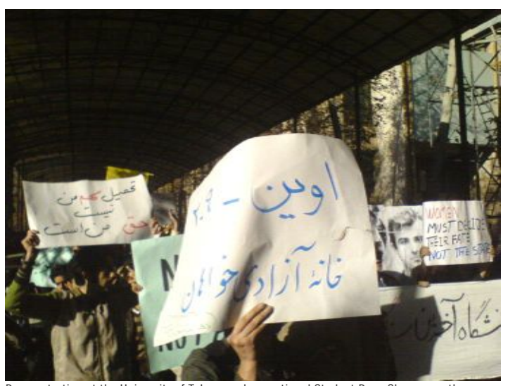
Demonstration at the University of Tehran on Iran national Student Day. Slogans on the placards say "Section 209 of Evin Prison; the house of those who demand freedom" and "Education is not my share, it is my right".

"We, the signatories of this complaint, have been tortured. One of the most usual forms of torture that we have been subjected to has been detention in small solitary confinement cells; a method that has been acknowledged by the highest officials of the country to constitute torture. Interrogators and prison guards confirm that the accused suffer serious psychological and physical complications after a few weeks in solitary confinement. More severe forms of torture that some of us have been subjected to include methods such as pushing the head into the toilet and being forced to eat the interrogation papers...the interrogators subject the accused to such pressures not for obtaining the truth but in order to force the accused to confess to false accusations and whatever the interrogators want." 1777