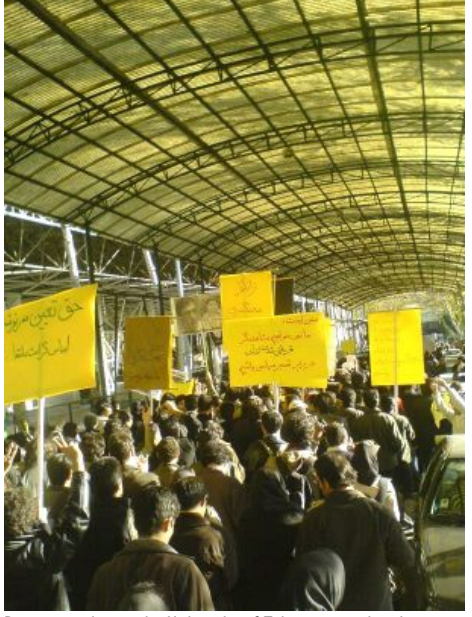
Demonstration at the University of Tehran on national Student Day, 7 December 2007.

In June 2008, new student protests erupted after a female student accused the Deputy Chancellor of Zanjan University, who headed its Disciplinary Committee, of attempting to sexually assault her. ISA activists, whom she informed, secretly filmed and recorded a meeting between her