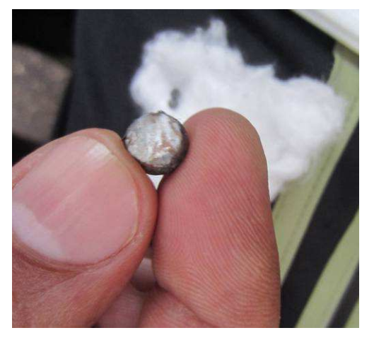
Shotgun pellet shown to Amnesty International researchers by a doctor treating a patient injured in the violence in the vicinity of the Republican Guard Club on 5 July

round of violence. A number of protesters acknowledged that the security forces initially fired shots into the air.