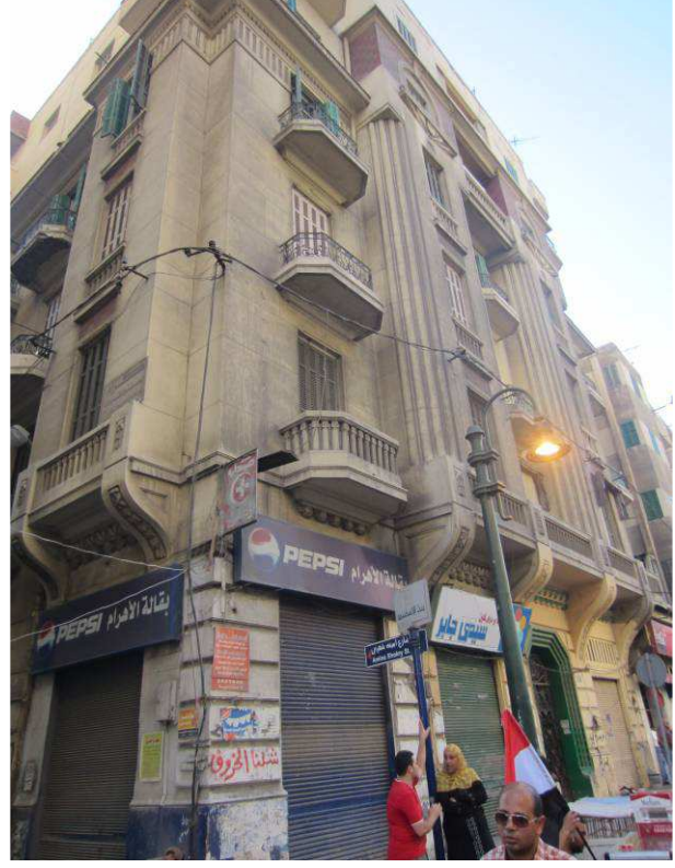
Above: A survivor of a horrific attack by pro-Morsi supporters on youths on top of a roof in Alexandria shows Amnesty International his injury; Below: Supporters of Mohamed Morsi threw opposition protesters from the roof of this building on Mushir Street, Alexandria, on 5 July