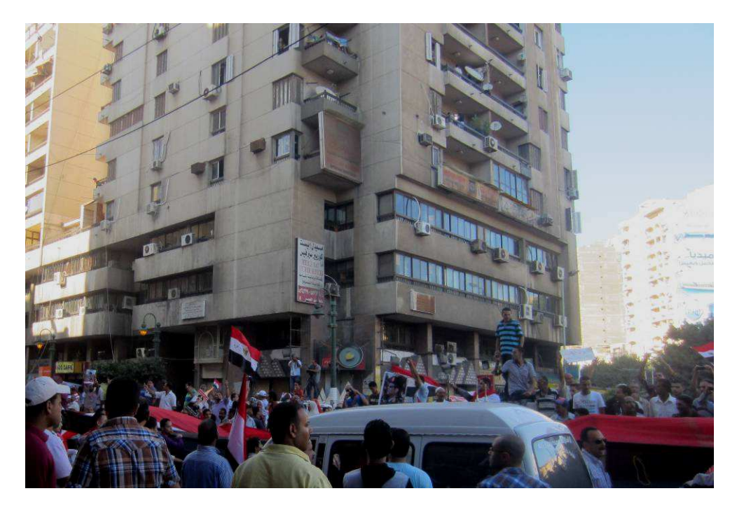
Protests opposing deposed President Morsi in Mushir Street, Alexandria on Sunday 7 July

The evidence gathered by Amnesty International in Egypt strongly indicates that some of those who died in protests and political violence on 5 and 8 July were unlawfully killed by security forces using excessive force, including lethal force against people who posed no danger to the security forces or others. Others were killed in clashes between supporters and opponents of the ousted President amid the failure of security forces to intervene to stop the violence.