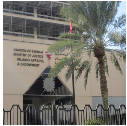
Ministry of Justice building, Manama

The Minister of Justice was also empowered through further amendments to the Law on Political Associations in August 2014 (Law 34 of 2014) to file court cases to close political associations for up to three months in order for them to correct breaches of the law on political associations, the constitution or any other laws or, in the case of a "serious breach" to close the association. However, the decree fails to define what constitutes a "serious breach" leaving a level of ambiguity injurious to the free functioning of political associations. Law 34 of 2014 also prohibits political associations from "using a religious platform to spread their