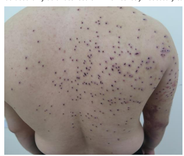
Birdshot injuries sustained by a protester shown to Amnesty International researchers in Bahrain in January 2015.

Amnesty International fully recognizes the Bahraini authorities' duty to uphold the safety of the public and ensure public order, and that this task has become more challenging due to a rise in violence on the streets that has seen attacks on police officers and other members of the security forces, including a bomb attack at al-Daih village on 3 March 2014 that killed three police officers. At all times, however, when policing demonstrations, including those that the authorities consider illegal or that become violent, Bahraini law enforcement officers should comply with the standards that the international community has adopted to govern the use of force and firearms by law enforcement officials. These standards apply also to members of the armed forces or others when they are exercising powers normally exercised by the police. They are intended to ensure respect for the rights to life, liberty and security of the person, requiring that force may be used only when strictly necessary and then only to the extent required for the performance of their duty. According to the standards, firearms may be used only as a last resort – when strictly necessary to defend the user or others against an