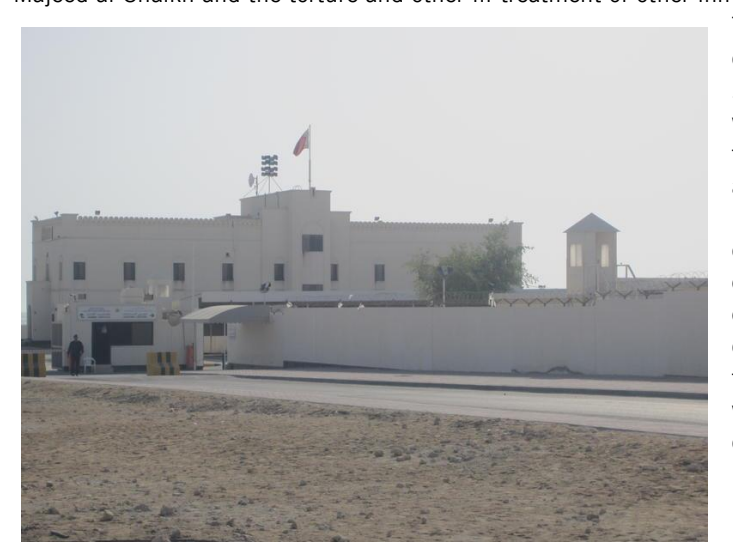
Jaw Prison, Manama

Three officers were charged under Article 208 of the Penal Code with torture leading to the death of one person and injury to other individuals held in their custody for the purpose of extracting information or forcing them to confess or punishing them for action they were suspected of having committed. The three