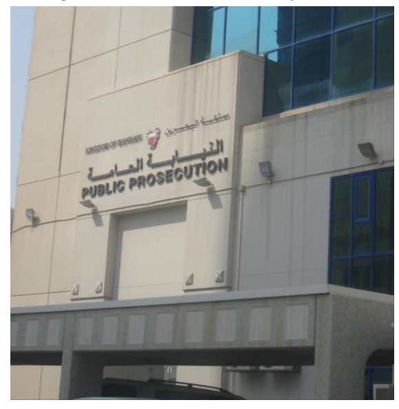
Public Prosecution Office where the Special Investigation Unit is located, Manama

Like other institutions, the SIU has obtained the assistance of international experts and agencies to provide human rights training for its officials. In June 2014, for example, the SIU signed a memorandum of understanding with the United Nations Development Programme (UNDP) to train all SIU officials in investigating deaths in custody or death resulting from the actions of the security forces and allegations of torture and other ill-