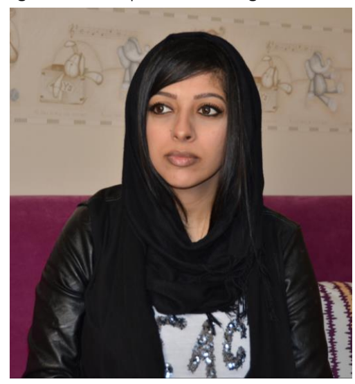
Zainab Al-Khawaja

political grounds, was arrested on 14 October 2014 while appearing before the High Criminal Court of Appeal in Manama in two separate cases, after she tore up a picture of the King of Bahrain and handed it to the judge, who ordered her immediate arrest. The following day she appeared before the PPO, who ordered her detention for seven days pending investigation on charges of "insulting the King". She continued to be held in 'Issa Town Detention Centre for Women, south of Manama, until 19 November 2014, when a court ordered her release on bail pending trial. On 4 December, she was sentenced to three years in prison on a charge of "insulting the King". She remains on bail pending her appeal, due to be heard in June 2015.44