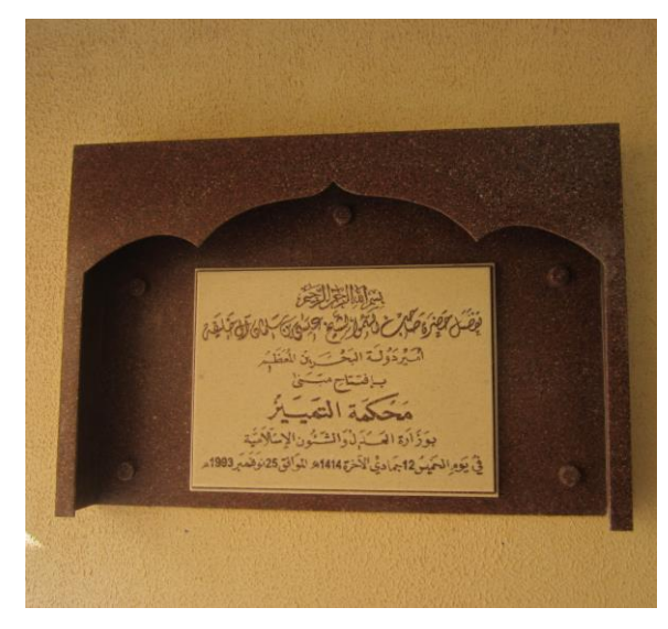
Court of Cassation, Manama

ill-treatment, and led to 48 members of the security forces facing charges. The SIU information indicated that 15 of the officers charged held the rank of First and Second Lieutenant and Lieutenant-Colonel, while the rest held lower rank. The SIU told Amnesty International that it had appealed a total of 12 cases to the High Criminal Court of Appeal and two cases to the Court of Cassation. According to information available to Amnesty International, all cases appealed by the SIU were rejected by the courts, which upheld the initial sentence. Out of the 36 cases the SIU referred to court so far, and whose trials closed, at least