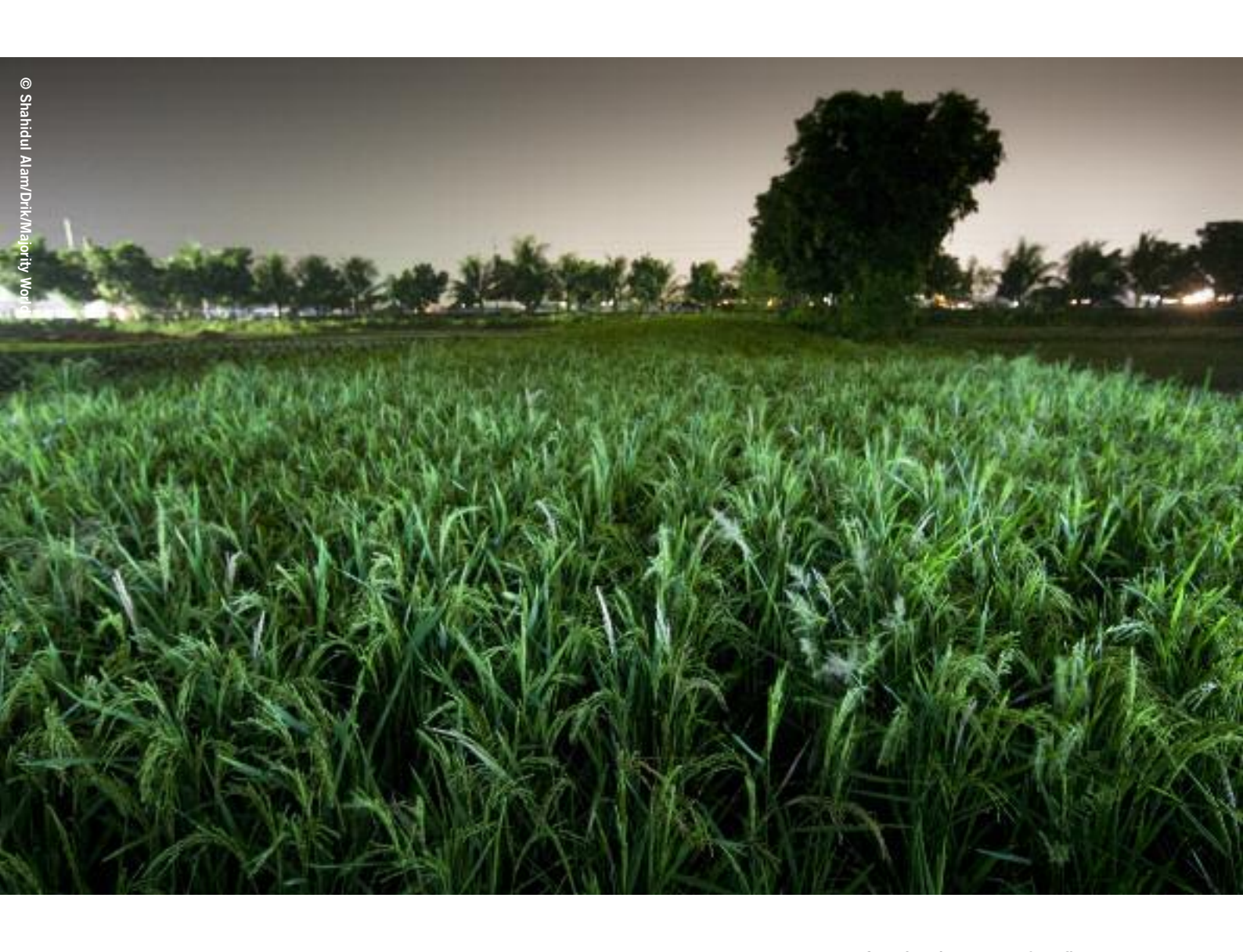
Image from Shahidul Alam's Crossfire , a photographic exhibition highlighting extrajudicial executions in Bangladesh.