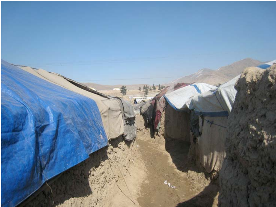
Internally displaced families living in slum areas such as Charahi Qamber, pictured, construct makeshift dwellings on abandoned lots from mud, poles, plastic sheeting, and whatever other materials they can find.

“The trend clearly indicates that displacement is on the rise,” as a 2010 report by the Brookings-Bern Project on Internal Displacement observed. 12 Over 57,000 people were displaced from their homes because of the conflict in the first three months of 2011, an increase of 41 percent over the last quarter of 2010. 13 Looking at the first six months of each year, the increase in displacement was even greater—the total of 91,000 people displaced between January and June 2011 was 46 percent more than the 42,000 displaced in the first half of 2010. 14