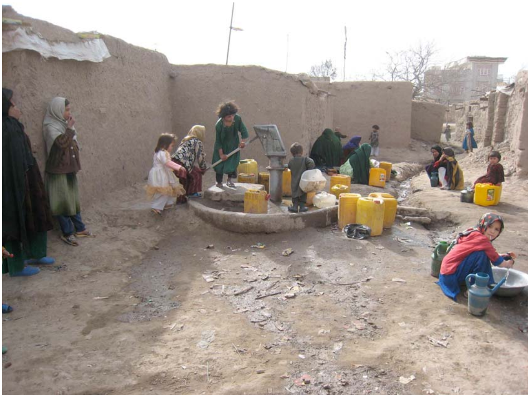
Three girls collect water while other children wait to use the pump in Minarets camp, Herat. Many families in Afghanistan’s informal settlements spend three hours a day or more gathering water; even then, the amount they are able to collect is barely sufficient for survival.