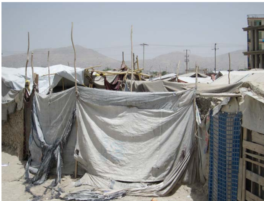
Some shelters are little more than scraps of canvas draped over wooden poles, as with this dwelling in Kart-e-Parwan, Kabul, photographed in June 2011.

As discussed earlier in this chapter, the conflict is a far more immediate and pressing reason for families to uproot themselves, particularly as the fighting spreads and intensifies. And as the rest of this report demonstrates, life in these urban slums is one of unrelenting misery, where even the basic requirements of life are barely met, belying the assumption that people stay there out of choice.