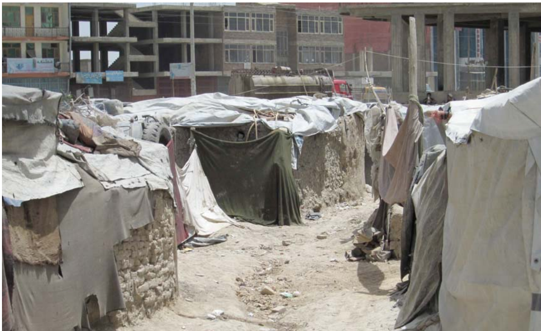
Residents of many informal settlements are at risk of forced eviction so that the land can be developed.

International law requires that evictions comply with appropriate procedural safeguards and afford due process to all affected persons. Evictions must not result in people being rendered homeless or made vulnerable to other human rights violations.