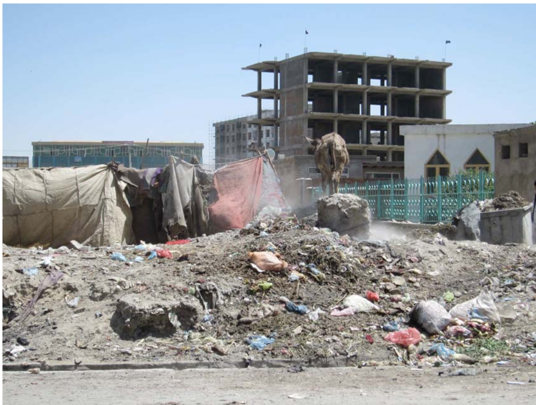
The residents of Kart-e-Parwan, in Kabul, have occupied an abandoned lot that doubles as a garbage dump.