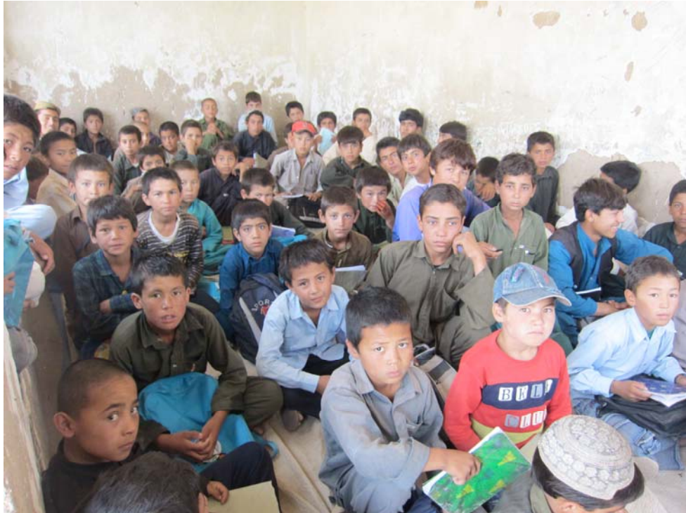
Children crowd into a classroom in Maslakh camp, on the outskirts of Herat.