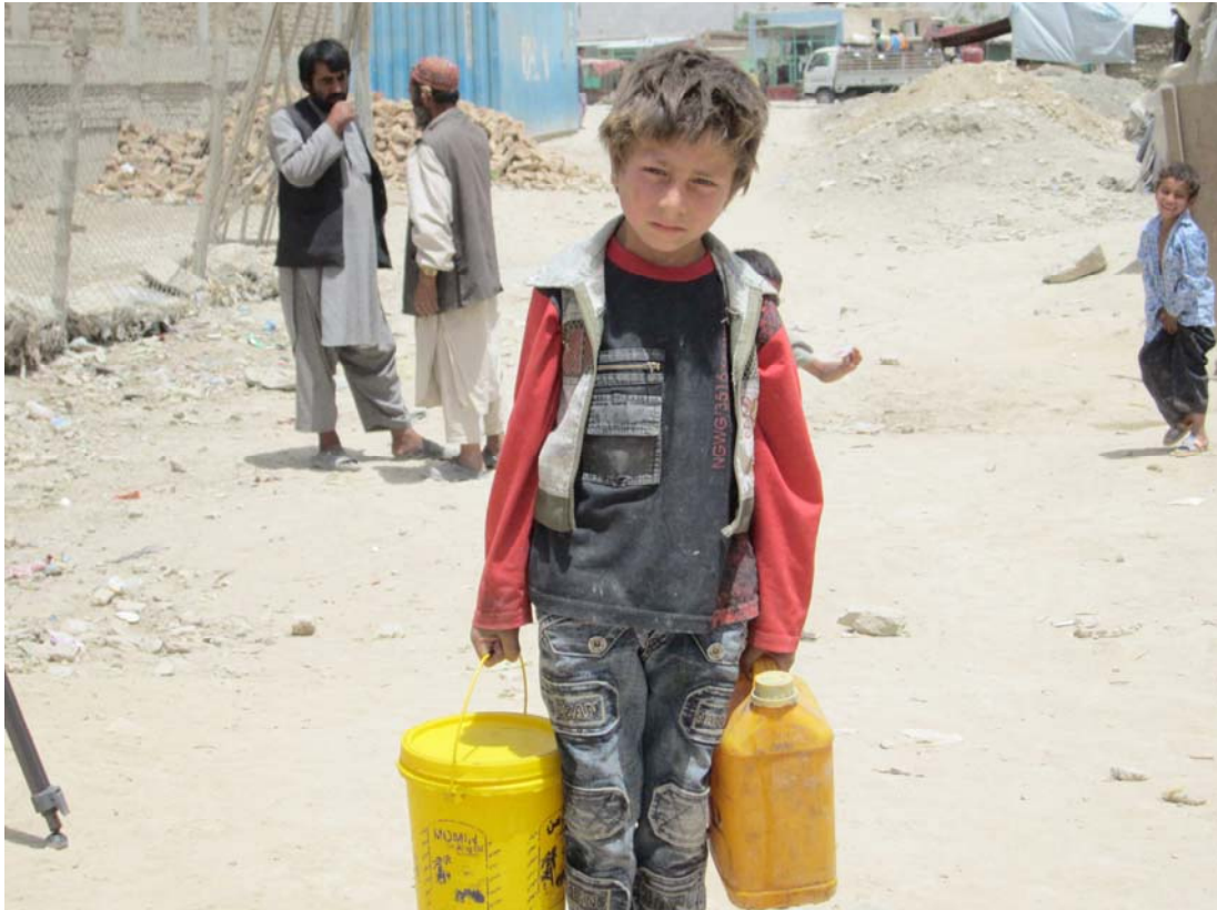
A young boy, about six or seven years old and living in the Chaman-e-Babrak settlement of Kabul, returns home with water on one of half a dozen trips he makes each day.

In addition, as UN-Habitat indicators note, access to safe water requires that households should not have to spend an undue proportion of income or time to acquire it. 101 The World Health Organization has estimated that when water access is basic, requiring a walk of up to one kilometre or within 30 minutes roundtrip, families are unlikely to be able to collect more than 20 litres per person daily, resulting in high public health risk from poor hygiene. When water collection requires a walk of more than one kilometre or more than 30 minutes roundtrip, families are unlikely to be able to collect more than five litres per person each day, hygiene practice is compromised, and basic consumption needs are not met; the World Health Organization classifies such conditions as “no access” to water. 102 With regard to cost, the UN Committee on Economic, Social and Cultural Rights has noted that “water, and water facilities and services, must be affordable for all. The direct and indirect costs and charges associated with securing water must be affordable and must not compromise or threaten the realization of other Covenant rights.” 103