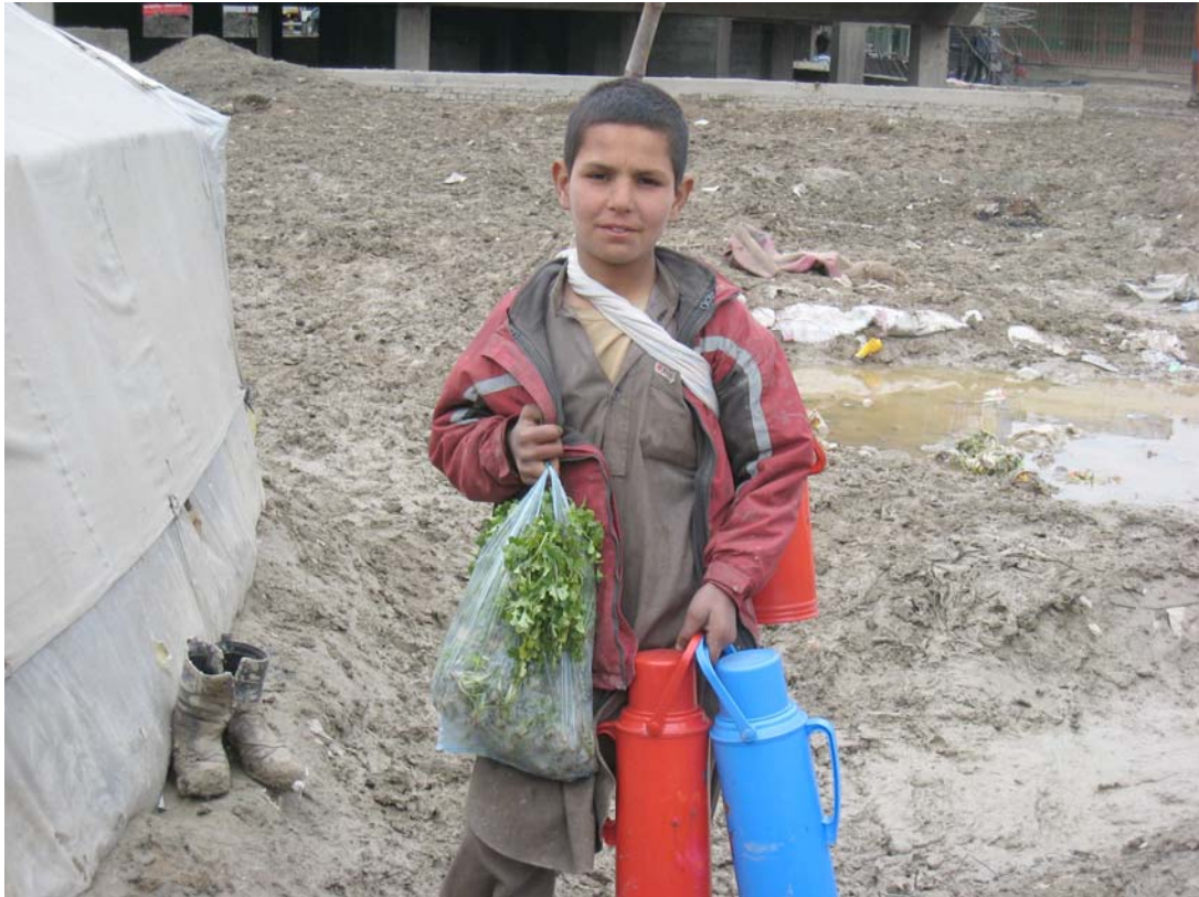
A 12-year-old boy sells tea in the market. He buys whatever food he can afford with the wages he earns each day.