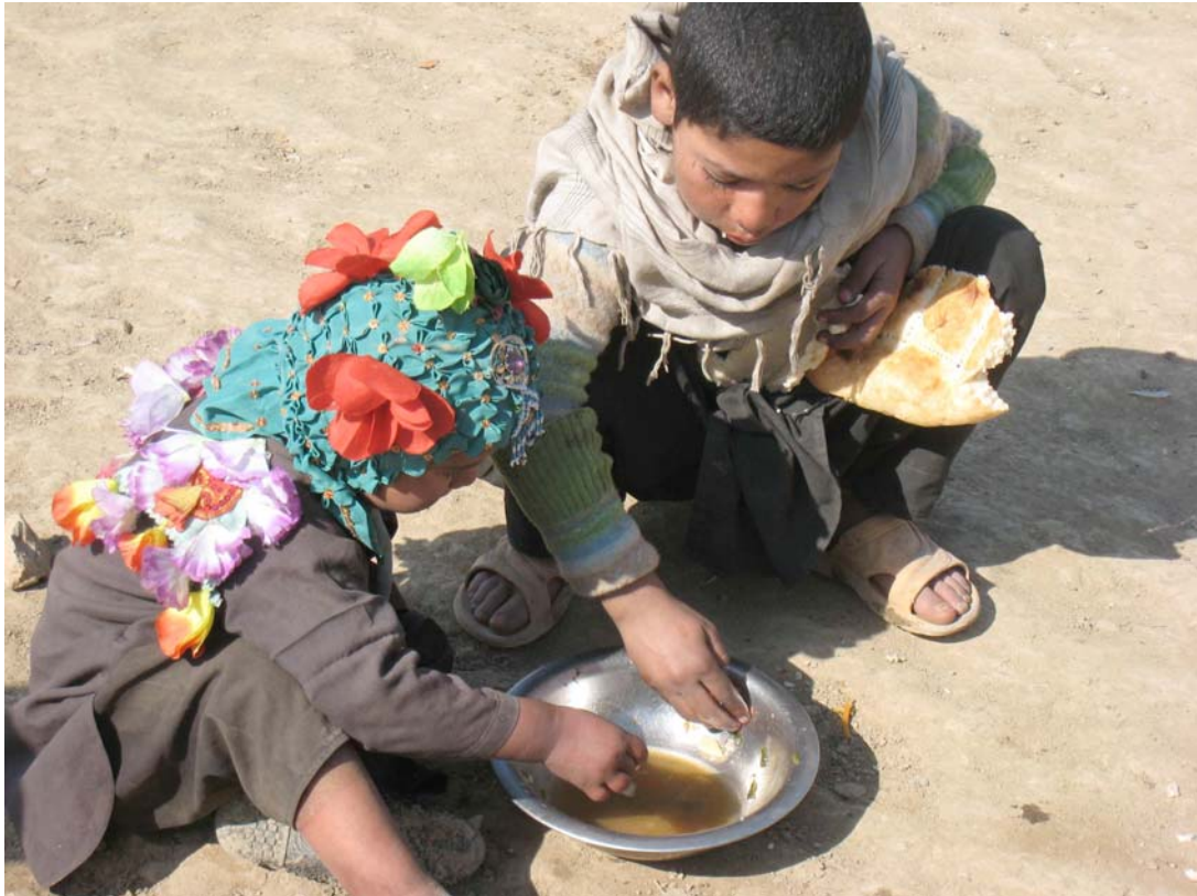
Two children in Charahi Qamber, in the west of Kabul, share a bowl of food provided by a local aid organisation. Many displaced families routinely go hungry.