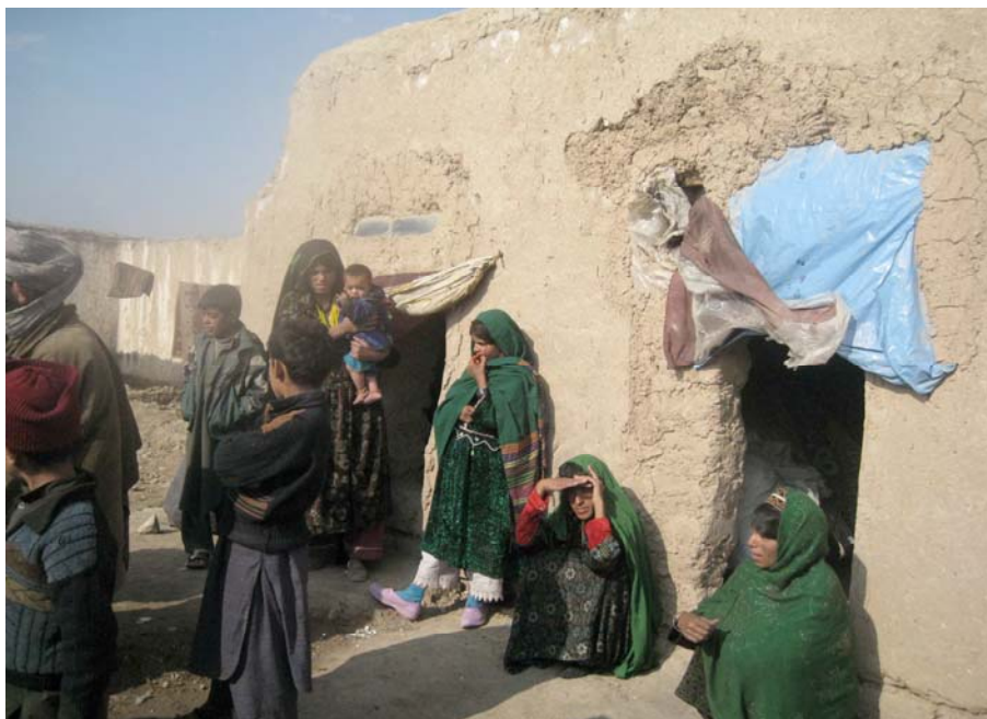
A family displaced from Badghis province has sought refuge in Herat's Maslakh camp.

Those who are displaced internally face periods of displacement that are likely to be longer than they have been in the past and a likely increase in secondary displacement to urban areas. As the Afghanistan Protection Cluster observed for the southern area: