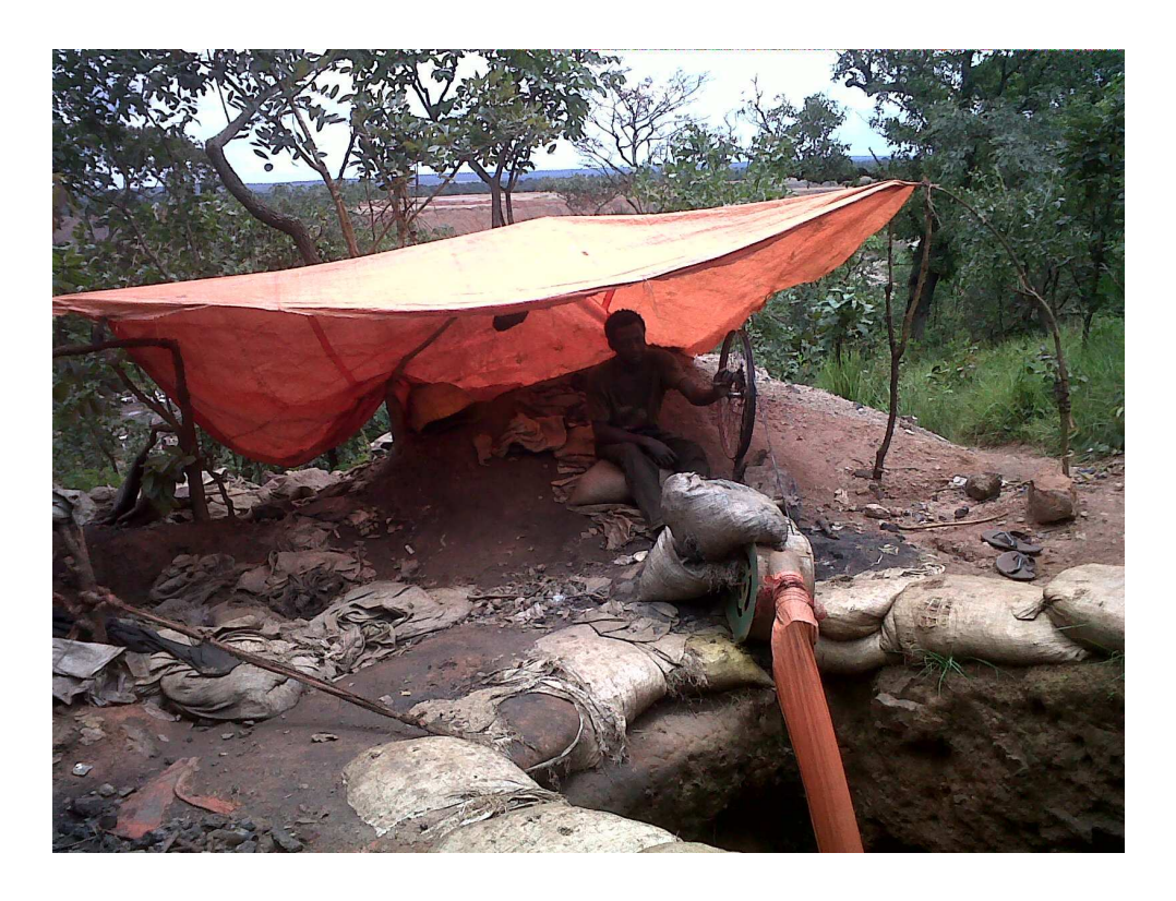
Improvised ventilation for a mine shaft at the Tilwezembe mine site, near Kolwezi, February 2012