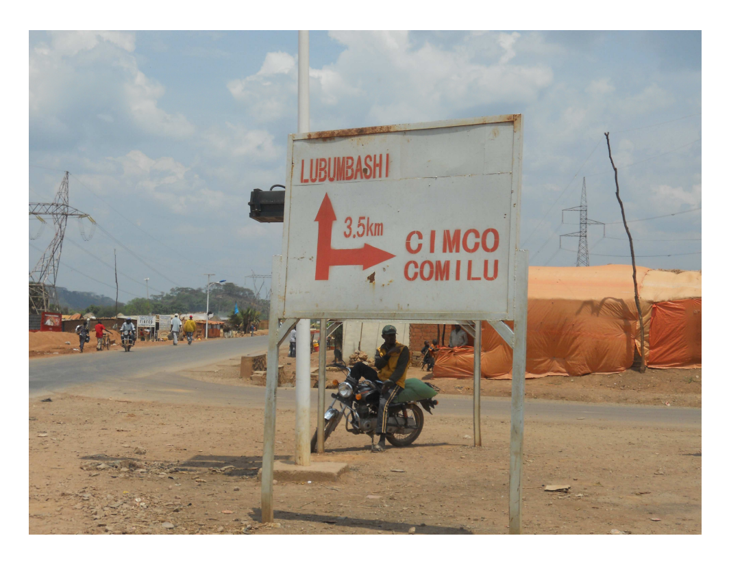
A signpost on the road to Luisha, where the companies Compagnie Minière de Luisha (COMILU) and Congo International Mining Corporation (CIMCO) have operations.