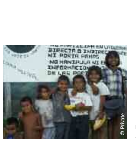
Left: Children of the San José de Apartadó Peace Community in Colombia.