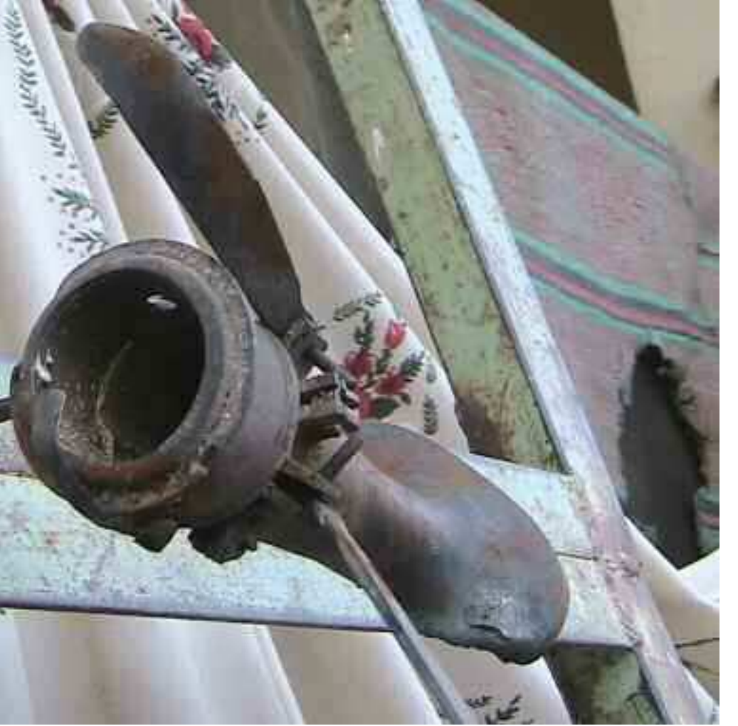
Part of an S-5M 57mm HE fragmentation rocket, recovered after an attack in February 2008 involving armed opposition groups in N'Djamena, Chad. During two days of fighting, hundreds of civilians were killed or injured.