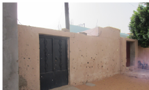
Front door where Kouri Wahli Linou sustained fatal shrapnel injuries. May 2012.