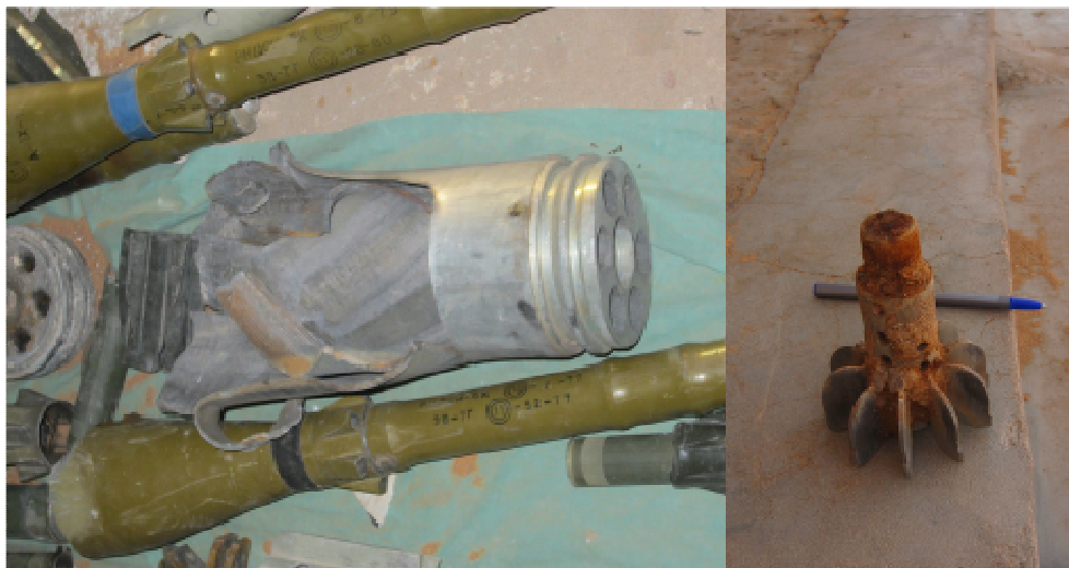
Remnants of weapons found by Amnesty International following clashes in the cities of Sabha and Kufra. May 2012.

Despite releases and the referral of some suspects to relevant civilian or military prosecution offices, progress in charging detainees with recognizably criminal offences has been extremely slow. Some detainees have been held without charge for a year. With rare exceptions, detainees have no access to lawyers and are interrogated alone, despite guarantees stipulated in the Libyan Code of Criminal Procedure. 6 The Minister of Justice told Amnesty International that by June 2012, 164 people had been convicted in common law cases since the end of the conflict. To Amnesty International's knowledge, by early June, only three trials have begun in civilian courts in relation to crimes committed in the context of the conflict, leaving thousands of people detained without trial.