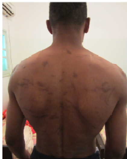
Man from Traghen shows Amnesty International his torture marks. May 2012.

Nine Tabu armed men in military dress captured a