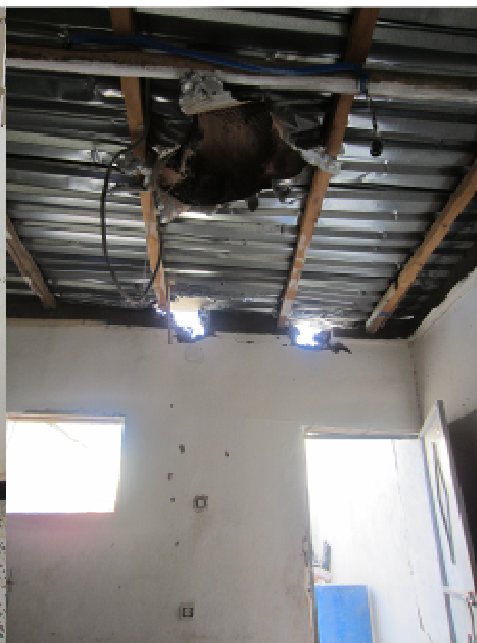
Ezzedine Touka, 6, was killed by shrapnel on 28 March. His sister stands in front of their house. May 2012