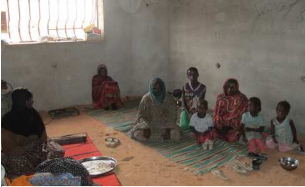
After being forced out of their homes by force during armed clashes, some 40 Tabus were squatting in a house under construction, with no water or electricity. May 2012.

The woman was squatting in a house under construction, with no running water or electricity, together with five married women, their husbands, and some 30 unmarried young people and children.