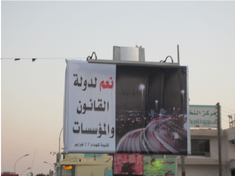
Sign in Benghazi: 'Yes to a country of law and institutions'.

The new Libyan authorities - to emerge from the July elections - will face the difficult task of fixing a country left damaged and divided by four decades of repressive and arbitrary rule, where some people lived above the law and others outside of its protection. The post-conflict period, which has been marked by lawlessness and human rights abuses, demonstrates how challenging it is to break a legacy of impunity, particularly in a country left with weak and mistrusted institutions.