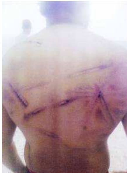
Detainee beaten in Ain Zara prison in May 2012.

17-year-old youth from Beni Walid held without charge by a militia in western Libya since October 2011, speaking to Amnesty International in May 2012