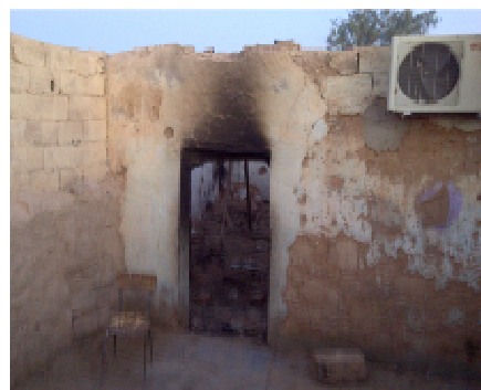
Burned home in Hijara following armed clashes in March. May 2012

Residents told Amnesty International that when they returned after the hostilities, they found their homes damaged and in some cases burned and destroyed. Video footage shows Arab militias entering these neighbourhoods, seemingly after the population left. In at least two instances, they are carrying gas canisters. Amnesty International saw homes in the Hijara and Nasriya areas that appeared to have been deliberately set on fire.