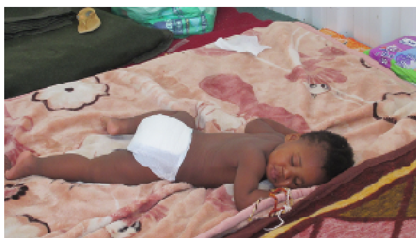
Baby sleeps in Bou Rashada detention centre. His mother told Amnesty International that she was arrested at home in Tripoli in early May for not having proper papers. May 2012

In May and June 2012, Amnesty International visited four detention facilities known as "holding centres" designed to hold irregular migrants – Tweisha in Tripoli, Bou Rashada in Gharyan, Ganfouda near Benghazi, and the Kufra detention centre. At the time, they held around 1,680 people between them. Amnesty International also interviewed foreign nationals held for breaches of migration-related regulations at the Silaa al-Tamwiniya detention facility under the control of a militia from al-Zawiya. Exact numbers of individuals held for migration-related offences are difficult to determine as they fluctuate regularly with fresh arrests, releases and deportations, as well as transfers between detention centres.