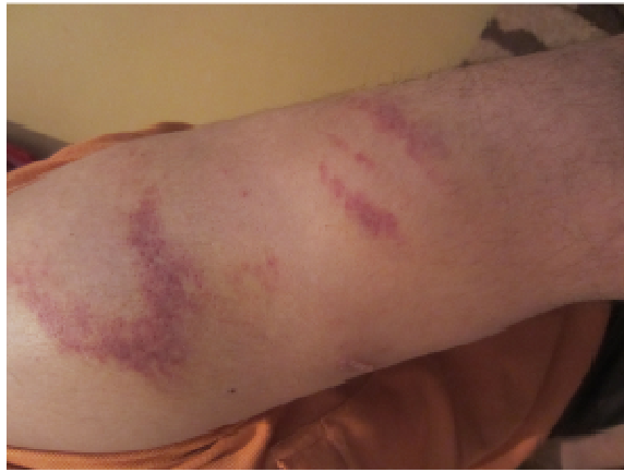
Detainee shows Amnesty International fresh torture marks inflicted on him at a prison under the control of the Ministry of Justice. May 2012.

positions, with various implements such hoses, rifle butts, electric cables, water pipes and belts. Other forms of torture include electric shocks; burns inflicted by cigarettes, boiling water or heated metal; threats of murder or rape; and mock executions.