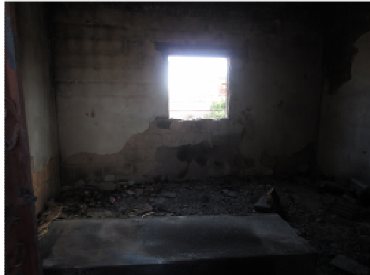
Burned house in Traghen as a result of attacks by Tabu militias in October 2011. Residents complain that they have yet to be compensated for their losses by the NTC. May 2012