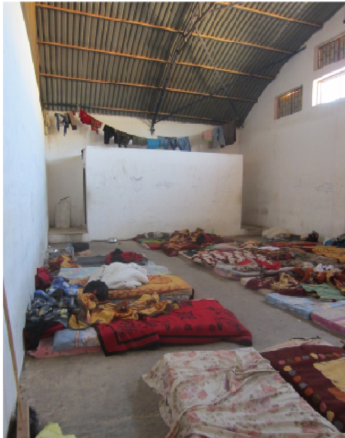
Cell at Ganfouda detention centre. More than 225 people from various nationalities including Somalia, Pakistan, Sudan, Chad, Egypt, Eritrea, and Ethiopia were detained in Ganfouda in May 2012.

At the Ganfouda detention centre, a different approach is taken in regards to nationals from Somalia. A member of the armed militia controlling the centre and the director explained to Amnesty International that they search for work opportunities through “Libyan sponsors” for detained foreign nationals. In these work schemes, they prioritize “good Somali Muslims” if they have valid passports, their embassies vouch for them and they have “no contagious diseases”.