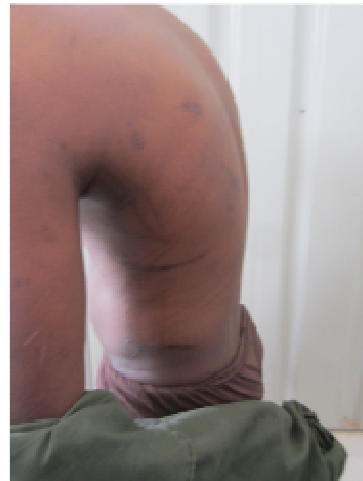
Ghanaian national detained in Libya shows Amnesty International his torture marks. May 2012

Amnesty International met a 24-year-old Ghanaian who had been arrested by armed men at a checkpoint in February while making his way from Sabha to Tripoli, along with two other Ghanaians and a Togolese national. They were detained for not having proper papers. The 24-year-old man said he had been beaten severely at the end of March after a failed escape attempt. He said that he was taken into the courtyard and beaten for four hours all over his body, particularly on his arms and back, by a large group of armed men. His scars, visible some two months later, corroborated his account.