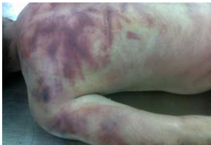
Amnesty International documented more than 20 deaths in custody at the hands of militiamen since September 2011.

Amnesty International gathered detailed information about at least 20 cases of deaths in custody at the hands of armed militias across Libya since September 2011. Medical records and forensic reports, examined by the organization, confirmed that the deaths were the result of abuse – mostly prolonged beatings, leading to internal bleeding and acute renal failure. In at least two cases, detainees died