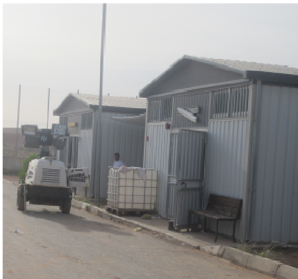
Bou Rashada detention centre. May 2012.

A rubbish collector from Mali, who had lived in Libya for three years, was stopped along with 10 other Malians and four Nigerians from their home in Ain Zara, Tripoli, in late March. He said that they were taken by a group of six or seven men in military dress, put in 4x4 vehicles and driven about 100km to an armed militia base near Gharyan, where other Libyans and non-Libyans were detained. He said: