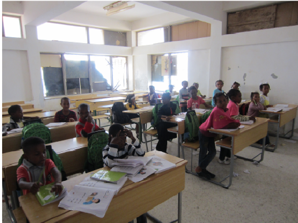
Displaced Tawargha children in poorly resourced classrooms inside the Janzour Naval Academy IDP camp. May 2012.

The authorities have also failed to resolve the situation of entire communities displaced during the conflict and unable to return to their homes, which were looted and burned by armed militias seeking revenge. Entire towns and villages were deliberately rendered uninhabitable by the militias, which accused the displaced communities of supporting the toppled government and of committing crimes on its behalf. The entire population of the city of Tawargha, estimated at 30,000, was driven out by Misratah militias and remains scattered across Libya, including in poorly resourced camps in Tripoli and Benghazi. 7 The Mashashiya community from the areas of Awaniya, Zawayat al-Bajoul and Omer in the Nafousa Mountain faces a similar plight at the hands of Zintan militias. Their suffering intensified following armed assaults on Sgeiga and Mazda in June – home to Mashashiyas – including those who sought shelter after being displaced during the conflict. The violence led to 105 deaths, according to government estimates, and further displacement. 8 Not only are such communities barred from going home; they also continue to face arbitrary arrest and other reprisals.