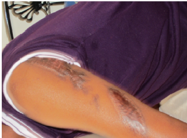
Tawargha man shows Amnesty International his torture marks. May 2012.

Suspects are seized at home by groups of heavily armed men, frequently riding in pick-up trucks with machine-guns mounted at the back. Arrest warrants by the prosecution are never presented, 24 and thuwwar rarely identify themselves or tell distraught families where their relatives are being taken. Amnesty International also documented cases of individuals seized from their workplace and bundled into cars or pick-up trucks, who then disappeared without