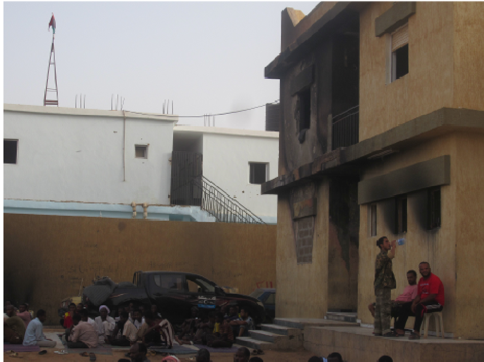
Kufra detention centre. May 2012.

A group of about 20 Somali women, who arrived in Libya after the end of the conflict, told Amnesty International that they were intercepted at sea by two big ships, with Libyans on board, on 29 March. They described embarking at dawn from the coast of Tripoli with some 80 other people of different nationalities, and being intercepted by a Libyan coastguard at about 3pm that day. All of them were immediately taken to a detention centre in Tajoura where they spent a week, before being transferred to the Tweisha detention centre.