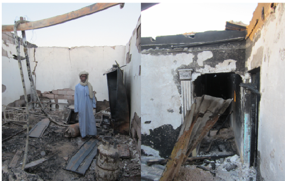
Nasriya residents show Amnesty International their burned and damaged homes, after an assault by Arab militias in March 2012. May 2012 ©Amnesty International

Local residents in Nasriya, a Tabu neighbourhood composed of some 80 families, according to local estimates, told Amnesty International that at about 1.30pm on 27 March, Arab armed militias in tanks and pick-up trucks with machine-guns mounted on top entered their neighbourhood. As the militias advanced, residents escaped and no casualties were reported. When they returned they found their homes and vehicles burned and damaged. Amnesty International assessed the extensive damage and found scores of homes that were charred inside and rendered uninhabitable.