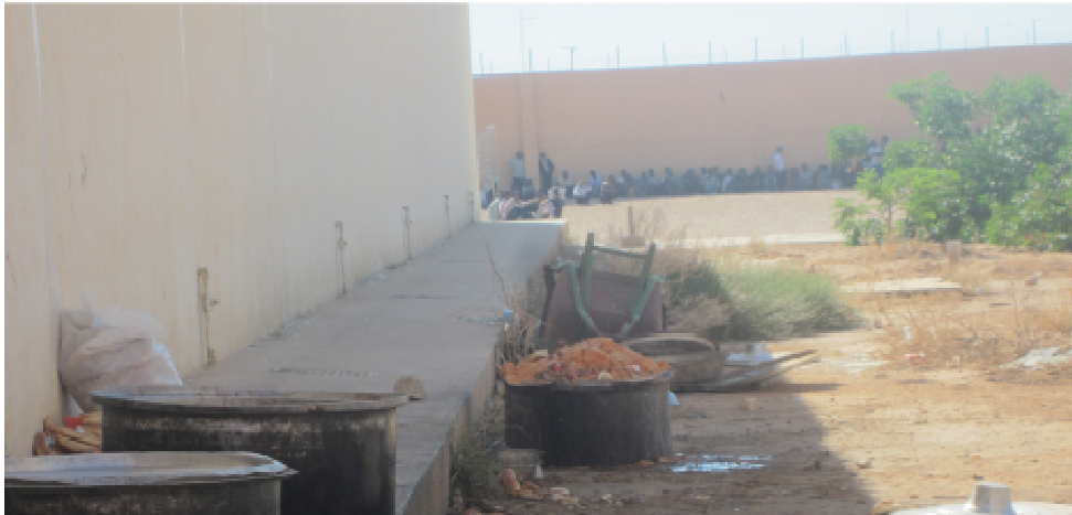
Foreign nationals detained in Ganfouda including Somalis and Eritreans. They have no possibility to apply for asylum or challenge the legality of their detention. May 2012

Detention centre officials acknowledge that nationals of Somalia and Eritrea cannot be sent back to their home countries. There is nonetheless no standard approach to address the situation of such individuals in need of international protection.