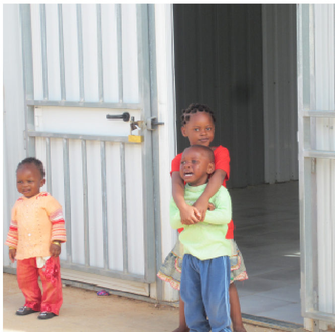
Children at Bou Rashada detention centre for migrants. More than 1,000 men, women and children are detained at Bou Rashada by an armed militia for being “undocumented migrants”. May 2012.

During Colonel al-Gaddafi's rule, foreign nationals – particularly those from Sub-Saharan Africa – lived with uncertainty and fear of changing policies, arbitrary arrest, indefinite detention, torture and other abuses. After the “17 February Revolution”, their situation was made more difficult by the general climate of lawlessness, the proliferation of arms among the population, and the failure of the authorities to tackle racism and xenophobia, fuelled by the widespread belief of the involvement of “African mercenaries” in the armed forces of the toppled government.