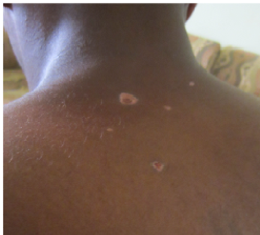
Tabu young man shows Amnesty International marks left by cigarettes burned on the back of his neck in detention. May 2012