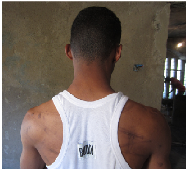
Former detainee shows Amnesty International his scars as a result of beatings. He was released without charge after three days in the custody of armed militias. May 2012

"I was first blindfolded. Then, they took me to an office, I think, and made me lie face down."